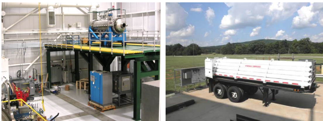
FIGURE 3. NTREES Test Facility and Hydrogen Setup.

The NTREES facility is licensed to test fuels containing depleted uranium. It includes a pyrometer suite to measure fuel temperature profiles and a mass spectrometer to help assess fuel performance and evaluate potential material loss from the fuel element during testing. After completion of this second phase upgrade to NTREES, tests on prototypical fuel elements will be performed wherein temperatures in excess of 3100 K in the presence of flowing hydrogen should be achievable. A picture of the current state of the NTREES upgrade is shown in Figure 2.