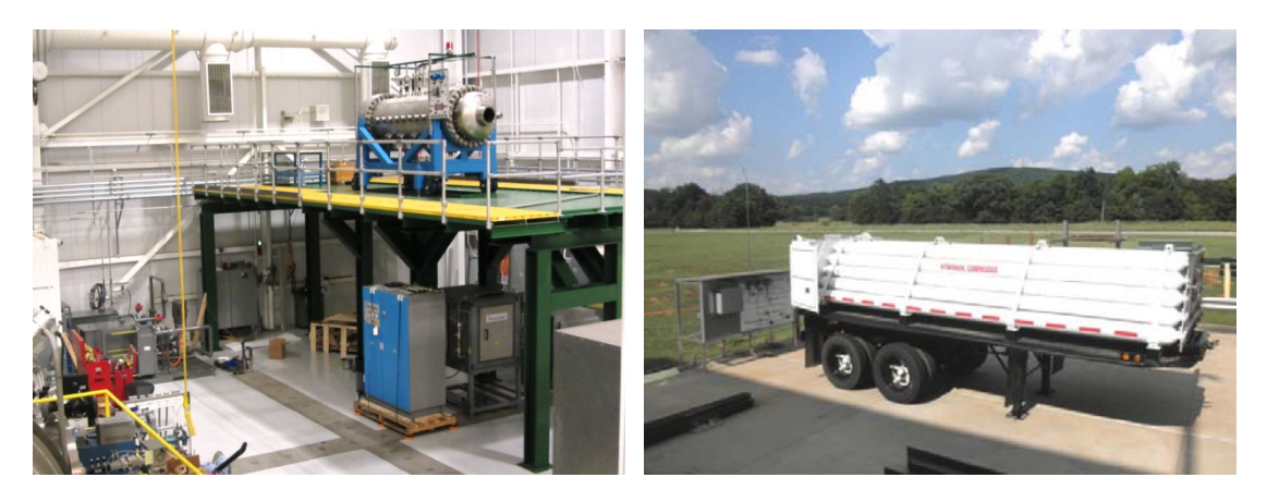
FIGURE 3. NTREES Test Facility and Hydrogen Setup.

The NTREES facility is licensed to test fuels containing depleted uranium. It includes a pyrometer suite to measure fuel temperature profiles and a mass spectrometer to help assess fuel performance and evaluate potential material loss from the fuel element during testing. After completion of this second phase upgrade to NTREES, tests on prototypical fuel elements will be performed wherein temperatures in excess of 3100 K in the presence of flowing hydrogen should be achievable. A picture of the current state of the NTREES upgrade is shown in Figure 2.