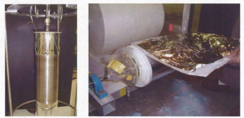
FIGURE 1. Cryostat-2 cold mass shown before (left) and after (right) roll-wrapping with insulation materials.

The insulation test materials were horizontally roll-wrapped onto the cylindrical cold mass for Cryostat-2 tests. The cold mass for Cryostat-2, before and after insulation wrapping, is shown in FIGURE 1. The materials were horizontally roll-wrapped onto a copper sleeve for Cryostat-1 tests. Cryostat-100 test article preparation was accomplished by hand lay-up of the materials onto the vertically positioned cold mass. Standard MLI or superinsulation (SI) constructions are composed of a reflective shield (aluminum foil 0.00724 mm thick) and spacer (fiberglass paper 0.061 mm thick), double-aluminized Mylar with paper spacer, or double-aluminized Mylar with bonded non-woven polyester spacer (Cryolam). The installed thickness for most test articles was from 20 to 25 mm.