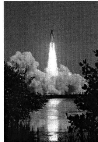
Fig. 1. The flames of Space Shuttle Discovery's Solid Rocket Boosters are reflected in the water next to Launch Pad 39B as the Shuttle leaps from the pad on the historic Return to Flight mission STS-114 [3].