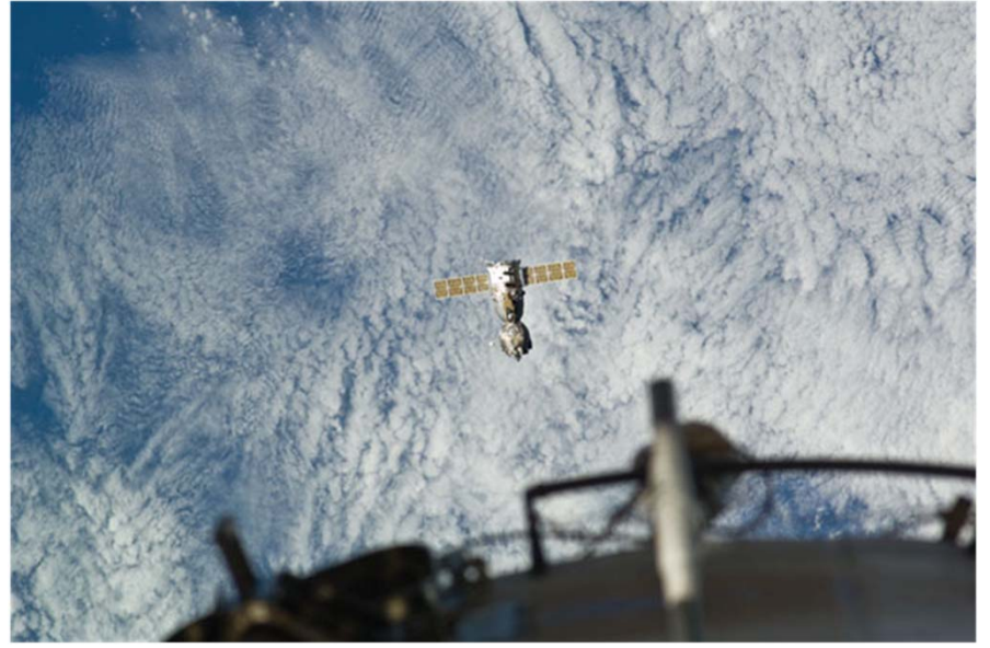
26S departs the ISS on September 16, 2011. Expedition 29 begins with only 3 crewmembers onboard for 61 days (four times longer than originally planned).