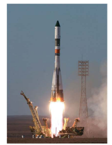
Launch of 43P - June 21, 2011