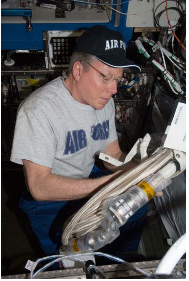
Expedition 29 Commander Mike Fossum in the LAB installing the Secondary Power Distribution Assembly Jumper. The SPDA jumper would provide a redundant power path should it be needed during a decrewed ISS phase.