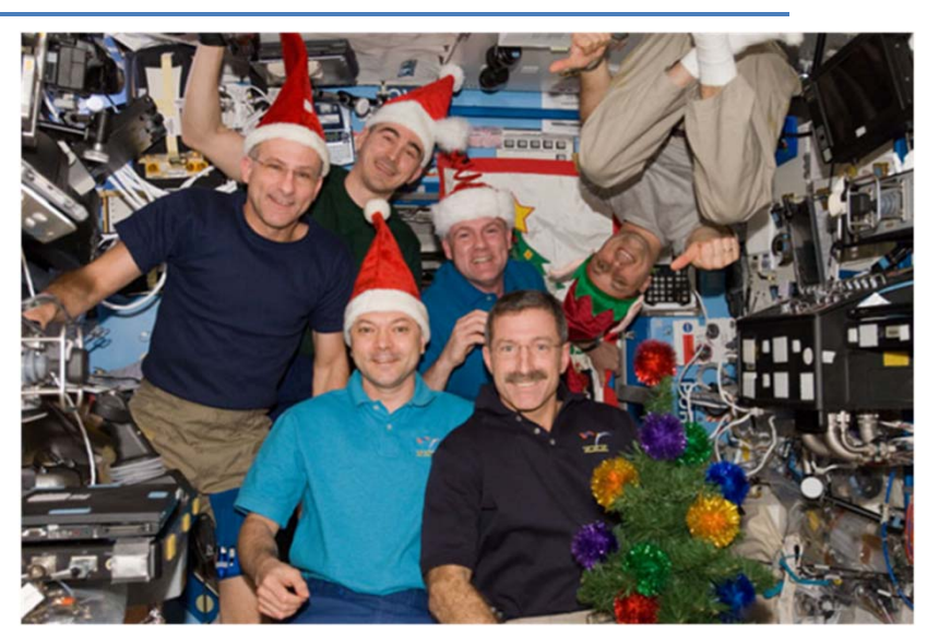
29S arrived on Dec 23, 2011, bringing the ISS to its nominal 6-crew compliment again. 28S undocked on April 27, 2012.