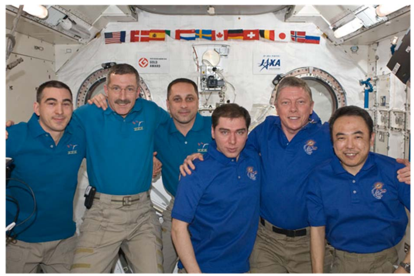
28S successfully docked to the ISS on November 16, 2011. The six crewmembers had 4.5 crewdays together prior to 27S undocking on November 22, 2011.