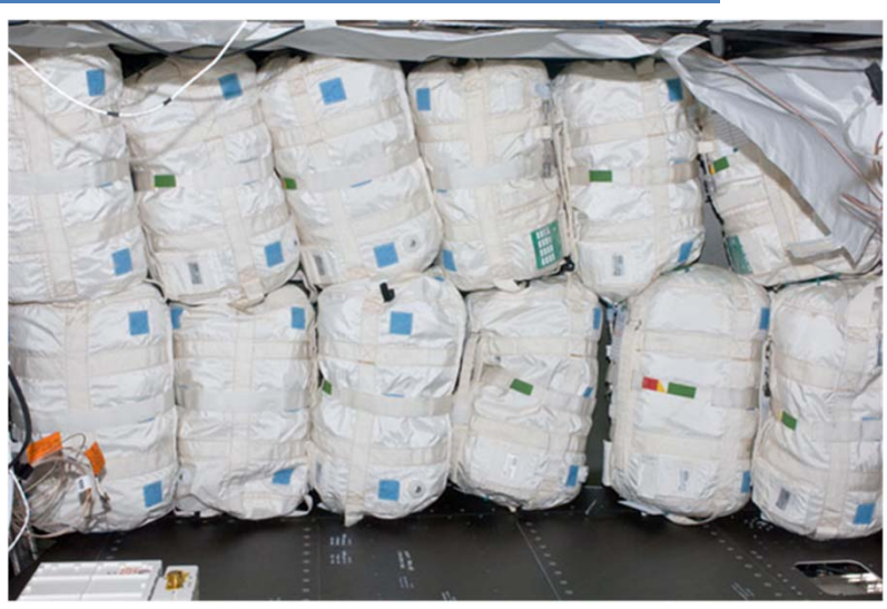
CWC Water Stowage bags