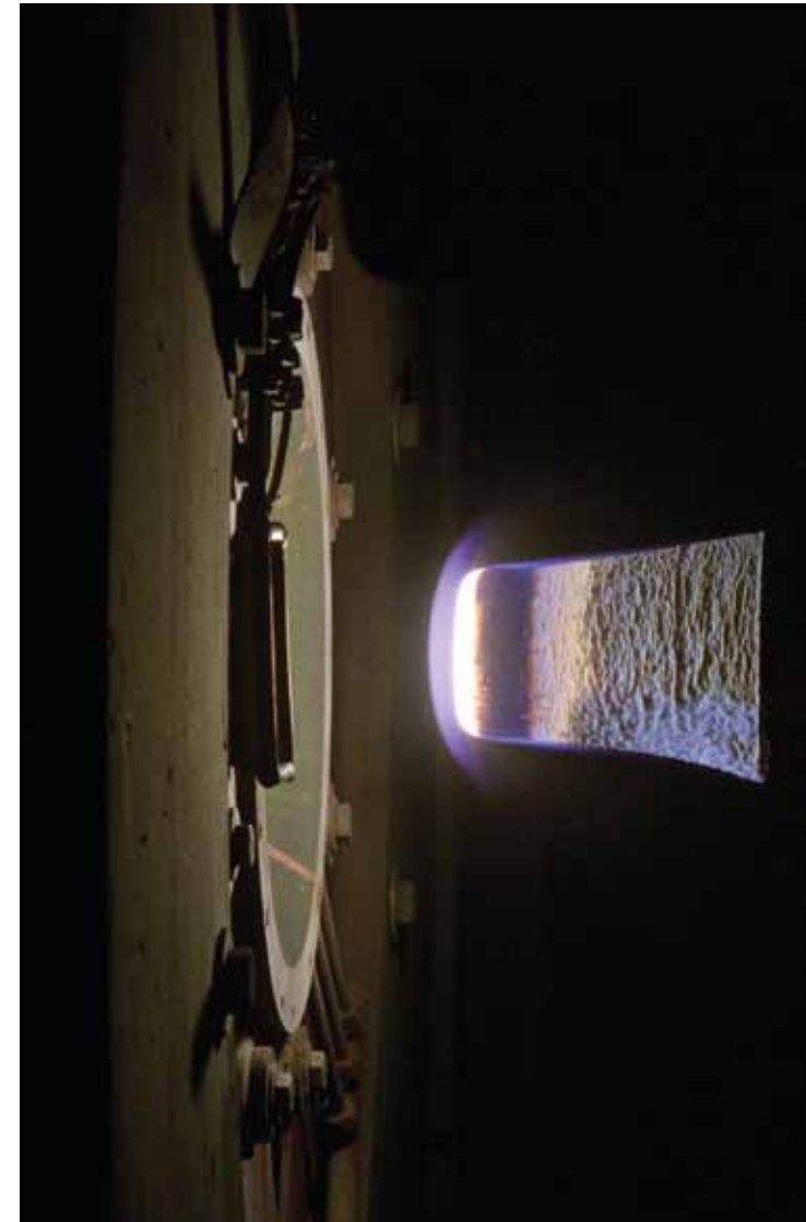
Ames Research Center's Arc Jet Complex reproduces heating and pressure conditions similar to the flight environment spacecraft experience during atmospheric reentry. Here the heat shield material that would be used for the Stardust spacecraft is being tested for reliability in those conditions.

In 2002, Elon Musk founded Hawthorne, California-based Space Exploration Technologies Corporation, more popularly known as SpaceX, with the express