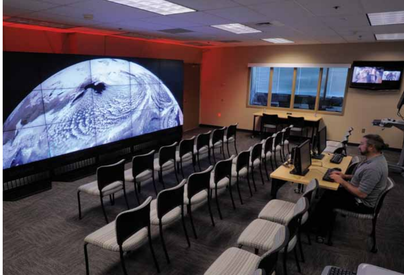
The NASA Center for Climate Simulation Data Exploration Theater features a 17-by-6-foot multi-screen visualization wall for engaging visitors and scientists with high-definition movies of simulation results. Here, the wall displays a 3.5-kilometer-resolution global simulation that captures numerous cloud types at groundbreaking fidelity. Parabon Computation's Frontier Collaborative Online Development Environment, or Frontier CODE, can facilitate both in the development and processing of such a simulation.

Further enabling that community is Frontier CODE's ability to accommodate different operating systems by providing the option to use so-called "virtual machines" to perform scientific calculations. For example, if someone uses a Windows operating system,