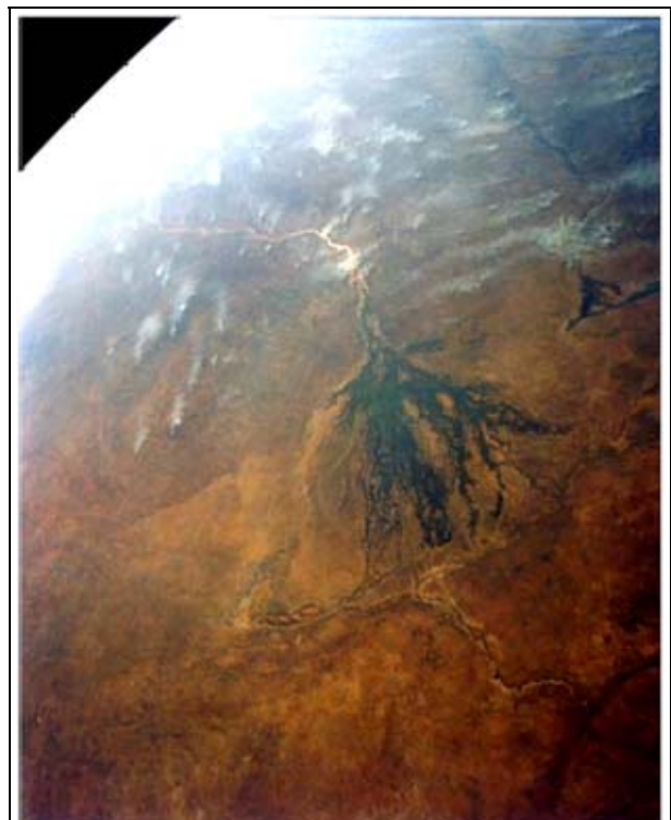
Figure 1: The Okavango River megafan is a classic feature seen from space since the dark vegetation contrasts with the surrounding dun-colored Kalahari Desert of NW Botswana. Flow is toward the camera. The megafan measures 150 km from apex to toe. Smoke plumes from numerous fires burn in southeast Angola (middle ground and top). Unique NASA frame no. STS43-151-32, 08/08/1991.

Present literature tends to lump together fans of all sizes [e.g., 4]. World surveys have now demonstrated con-