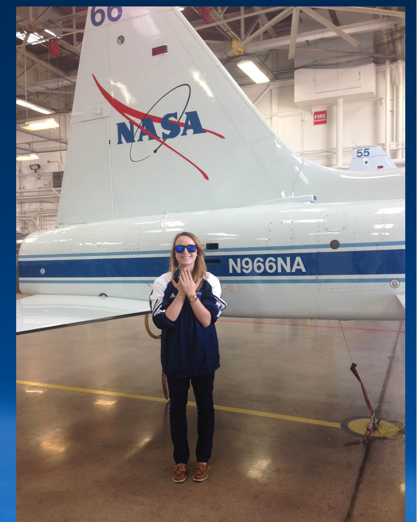
Figure 4: Ellington Field, T-38