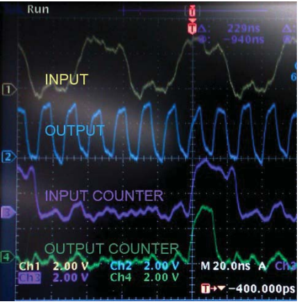
Fig. 3 – 4x lock

Some jitter was inevitable for frequencies over about 144 MHz on the output because the phase adjustment granularity is 4x less than the tapped delay line granularity for about a 20% short term frequency variation at those frequencies. A more sophisticated design using the tapped delay for phase adjustment should reduce this problem.