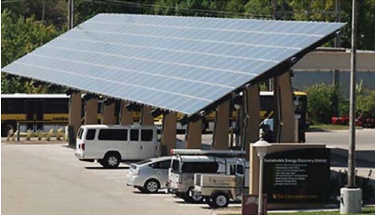
Figure 2. Charging station with solar panels at the University of Iowa.