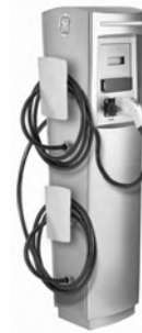
d. GE DuraStationNEMA3R