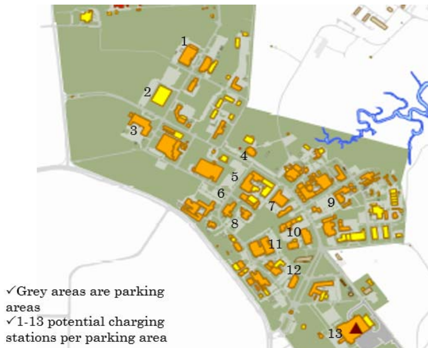
Figure 4. Map of NASA Langley Research Center with numbered parking lots.