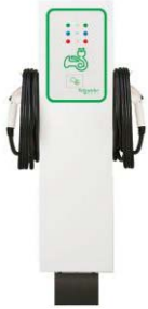
c. Schneider Electric EV230PDRR