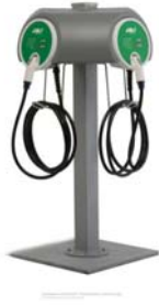
a. AeroVironment EVSE-RS+