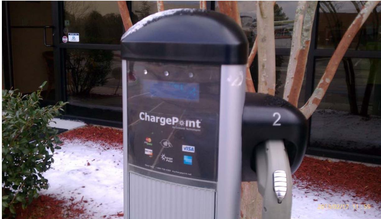
Figure 5. Close up of ChargePoint CT2021 screen.