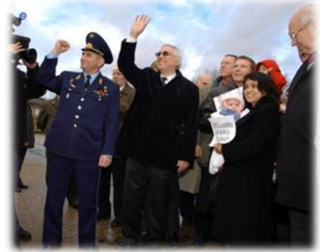
//////////////////////////////////// ISS Expedition 9 Spouse //////////////////////////////////// October 2004