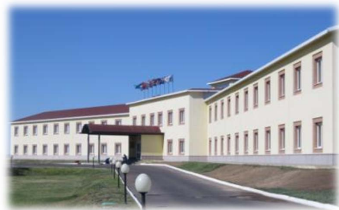
||||| Accommodations in Baikonur (Sputnik Hotel)