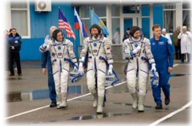
||||| Crew Walk-Out