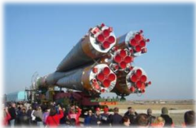
||||| Soyuz Roll-Out