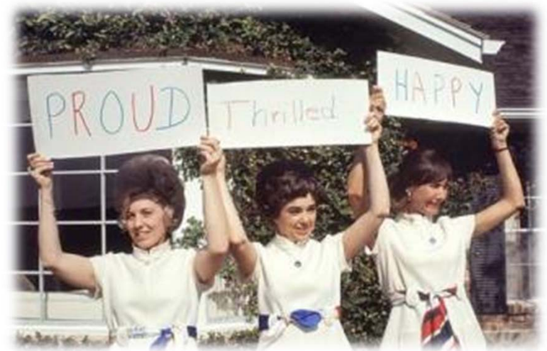
//////////////////////////////////// Apollo 12 Spouses //////////////////////////////////// November 1969