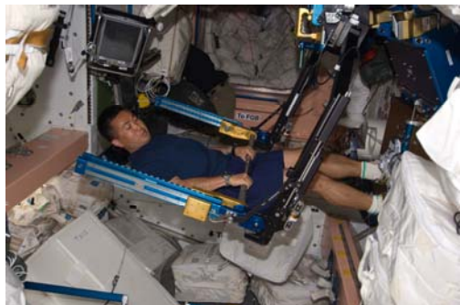
Exercise using the ARED