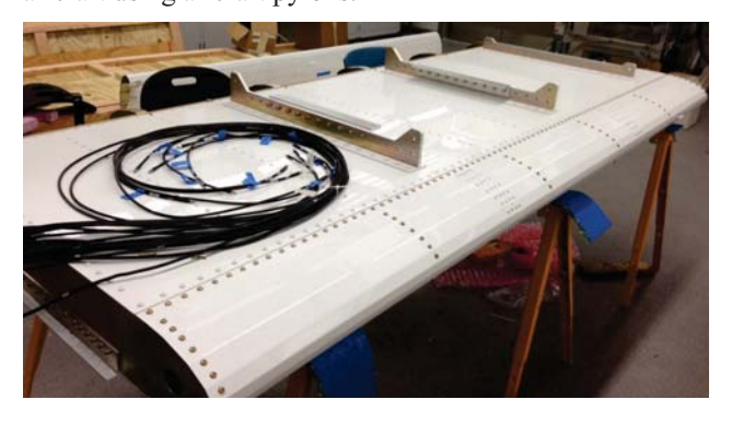
Figure 2. The EcoSAR antennas support single pass interferometry and full polarimetric operation with bandwidths up to 200 MHz.

The antennas are based on a stacked patch design that permits polarimetric radar operation with bandwidths up to 200 MHz. Ten subarrays make up each EcoSAR antenna. The antennas (see Fig. 2) are installed under the wing of the aircraft using aircraft pylons.