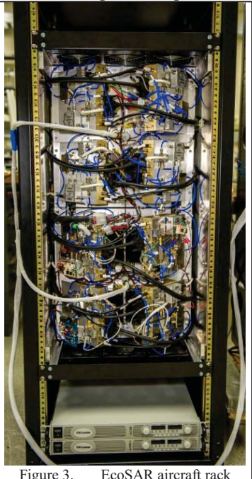
gure 3. EcoSAR aircraft rack containing 16 transceivers.

(SSPA), low noise amplifier (LNA), circulator, coupler, filters, and control switches. The T/R modules also include closed loops for robust calibration, dynamic beam control and adaptive waveform generation. The transmit path was designed accounting for dynamic range, impedance matching and signal levels. The receive path was designed in a similar fashion but noise figure and out-of-band rejection had to be considered. The T/R modules are installed on a aircraft racks for operation on the fuselage of a P3 aircraft, as shown in Fig 3.