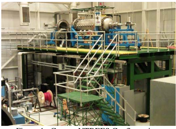
Figure 1. Current NTREES Configuration

loss occurring during testing. Figure 1 shows a picture of the new NTREES configuration.