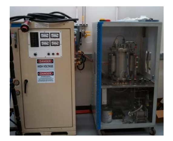
Figure 2. CFEET

Two potential NCPS fuels are currently under consideration - coated graphite composite fuel and tungsten cermet fuel. During 2014 a representative, partial length (~16") coated graphite composite fuel element with prototypic depleted uranium loading is being fabricated at Oak Ridge National Laboratory (ORNL). In addition, a representative, partial length (~16") cermet fuel element with prototypic depleted uranium loading is being fabricated at Marshall Space Flight Center (MSFC). During the development process small samples (~3" length) will be tested in the Compact Fuel Element Environmental Tester (CFEET) at high temperature (~2800 K) in a hydrogen environment to help ensure that basic fuel design and manufacturing process are adequate and have been performed correctly. Once designs and processes have been developed, longer fuel element segments will be fabricated and tested in the Nuclear Thermal Rocket Element Environmental Simulator (NTREE) at high temperature (~2800 K) and in flowing hydrogen. A picture of CFEET is shown in Figure 2, and a picture of NTREES is shown in Figure 3.