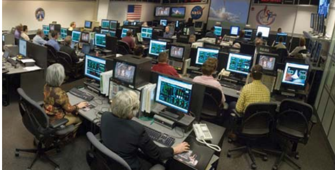
Figure 4: Space Launch System (SLS) Engineering Support Center (SESC)

SLS launch operations will be conducted by the Ground System Development Office (GSDO) Launch Operations Team, which will originate from the Kennedy Space Center (KSC) Launch Control Center (LCC). The SLS Engineering Support Team, located in the HOSC SESC, will provide overall launch support to the GSDO Launch Operations Team. The SLS Engineering Support Team consists of the responsible system engineers, program managers, chief engineers, safety engineers, and SLS Element subject matter experts. SLS Engineering Support Team members will assess the SLS vehicle state and provide engineering support as required by GSDO Launch Operations Team. Remote services