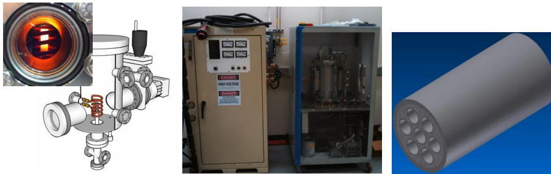
Figure 1: CFEET system and sample configuration