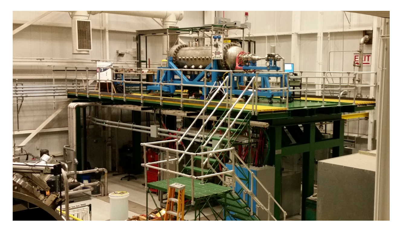
Figure 1 Nuclear Thermal Rocket Element Environmental Simulator (NTREES)

Recently, NTREES underwent an Operational Readiness Review (ORI) and the facility was declared safe to begin operation. As part of the review process, the facility underwent a complete certification process for the pressure system along with a Safety Assessment (SA) and a review of the Standard Operating Procedures (SOPs). A considerable amount of the the changes to the SOP were to make sure that the potential for contamination of the facility and surrounding area was reduced or eliminated. Figure 1 illustrates the current configuration of the NTREES facility.