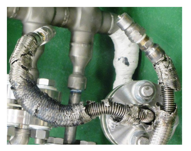
Figure 2 Induction Coil Assembly