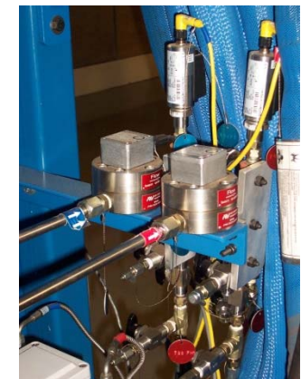
Portable New Delivery System (PNDS)