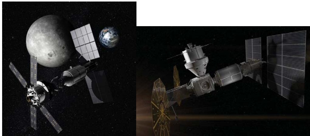
Figure 2: Deep-space habitation facilities for the 2020s using ISS-based designs and components.