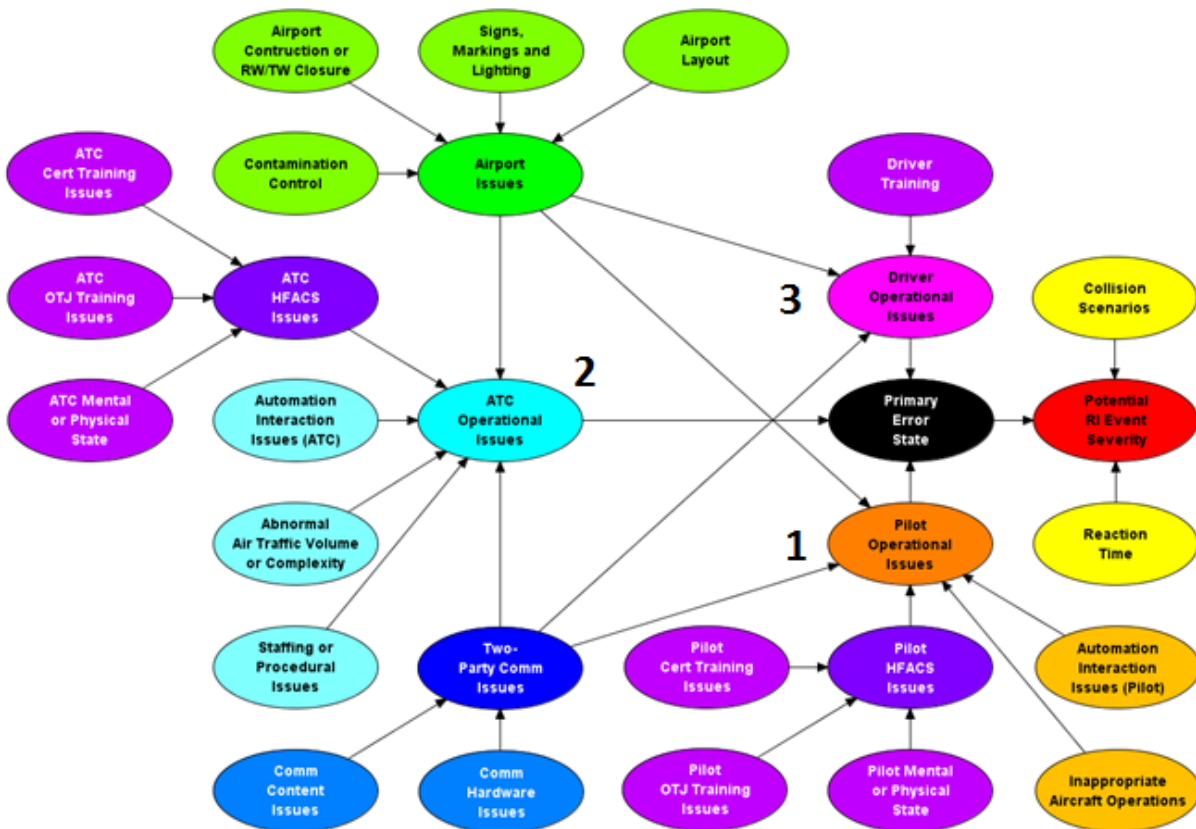
Exhibit 1. The Runway Incursion Bayesian Belief Network.

The reader should first observe the numbers in Exhibit 1, representing the three possible primary participants in an RI event: 1 is the pilot or pilots (orange node), 2 is the air traffic controller (ATC) or controllers (cyan node) and 3 is a airport or contractor vehicle driver (pink node). Each of these nodes has a number of other color-coded nodes with links pointing into these three primary nodes. Likewise, each of these three primary nodes have links pointing into the black node (Primary Error State). Starting with the green nodes (middle top), and moving counter-clockwise, the node descriptions of the RI event model follow: