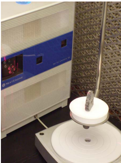
Figure 1: Laser scanner apparatus

Instrumentation and measurement: We utilized a NextEngine 3D Scanner HD model 2020i located on-site at NASA Johnson Space Center. This instrument was supplemented by ScanStudio HD Pro and the CAD Tools software. The scanner also comes with a rotating stage. Documentation for the scanner claims dimensional accuracy of 0.1 mm, with a capture densi-