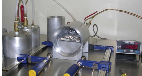
Figure 4: 14305,483 (wrapped in aluminum foil) in the larger pycnometer.

When compared with lunar samples and meteorites that had been measured with glass beads, there is good agreement in the data between the laser and the bead results for rocks of the same type (Fig. 3). Because only one glass-bead-measured sample was subsequently scanned (and it was only 4.5 gm), variation in results cannot a priori be attributed to either inhomogeneity among samples or measurement accuracy.