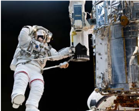
An astronaut conducts an EVA to repair equipment. Participation in EVAs and the associated ground training is a risk factor for shoulder injuries.

The purpose of this occupational health study was to determine the incidence rate of shoulder injuries incurred by NASA astronauts during their active duty NASA career and determine if the rate of injury has changed over time.