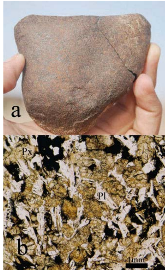
Figure 1.– (a) Photograph of the NWA 5298 meteorite showing its exterior. (b) A thin section of NWA 5298 seen under a microscope. The main minerals are pyroxene (Px) and plagioclase (Pl).

Findings from the study of NWA 5298 were published in the journal Meteoritics and Planetary Science : Hui, H., Peslier, A. H., Lapen, T. J., Shafer, J. T., Brandon, A. D., Irving, A. J. (2011). Petrogenesis of basaltic shergottite Northwest Africa 5298: Closed-system crystallization of an oxidized mafic melt. Meteor. Planet. Sci. 46 (9), pp. 1313-1328.