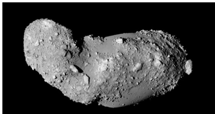
Figure 1.— The asteroid Itokawa, as photographed by the Japan Aerospace Exploration Agency’s Hayabusa spacecraft in 2005. The maximum dimension of the asteroid in this view is about 535 m (about a third of a mile). This asteroid is almost pathological in its regolith configuration, with textures ranging from patches of fine material to enormous blocks, such as the 50-m example at the extreme right, named Yoshinodai.

Earth-based astronomical observations have long implied and recent spacecraft missions have shown that even small asteroids (figure 1) are covered with unconsolidated debris (as is the Moon), which is generically termed “regolith.” The regolith on any typical airless body in the solar system is generated primarily through the breaking up (or “comminution”) of surface rock by impacting meteoroids. This is a process that, while it cannot be duplicated exactly on Earth for a variety of reasons, is amenable to simulation in the laboratory. All that is needed is an accelerator that can launch projectiles accurately at speeds of at least 2 km/s, a vacuum chamber, a piece of ordinary chondrite, a container to keep it confined, and people obsessed enough to shoot it 59 separate times, sieving it after every few shots and removing samples for later analysis. Amazingly, all of those requirements can be met in one place: the Experimental Impact Laboratory. (Actually, the ordinary chondrite is a piece from a larger meteorite that was found in Antarctica in 1985, brought to Houston, and kept in the Antarctic meteorite curatorial facility until it was allocated to us for the experiments.)