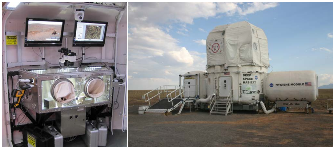
Figure 1.– GeoLab glovebox (left) inside NASA's DSH (right).

early scientific returns from future missions and ensure that the best samples are selected for Earth return. The facility was also designed to foster the development of instrument technology.