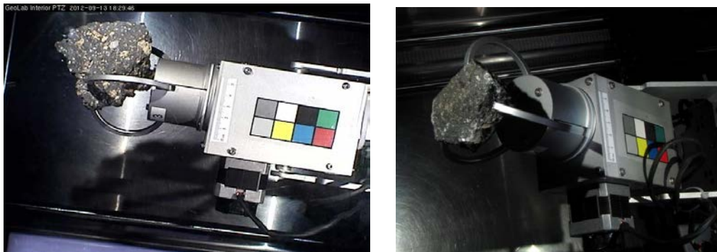
Figure 3.— Views of the robotic sample manipulator three-fingered end effector holding and positioning rock samples.

The robotic manipulator was required to be able to capture and release samples, translate the full volume of the glovebox, and precisely manipulate samples for imaging, microscopic examination, and positioning for XRF analyses. The full range of motion (translation in the X, Y, and Z directions, up and down pivot motion, and rotating end effector) was accomplished with a linear slide for the length of the glovebox (X-direction) and precision linear stages or motion along the Y and Z axes. The Z-axis linear stage was mounted on a motorized rotary stage.