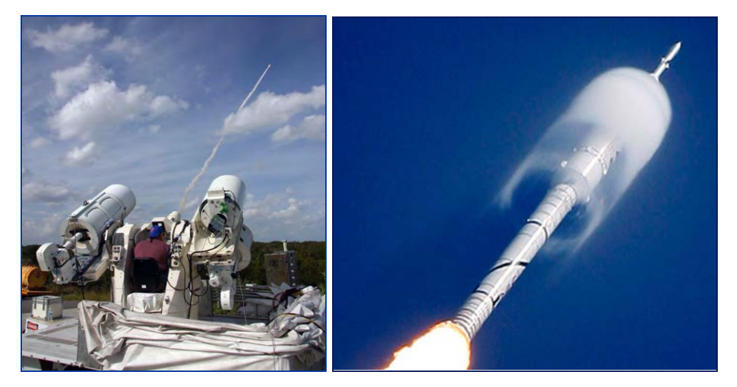
Figure 3.– (Left) Tracking cameras monitor ascent performance and separation events. (Right) The Ares 1-X test launch in October 2009.

The I<sup>2</sup> Team provides the customer (both commercial and Government) with access to a wide array of imagery options – ground-based, airborne, seaborne, or vehicle-based – that are available through the Government and commercial vendors. The team guides the customer in assembling the appropriate complement of imagery acquisition assets at the customer's facilities, minimizing costs associated with market research and the risk of purchasing inadequate assets. The NASA I<sup>2</sup> capability simplifies the process of securing one-of-a-kind imagery assets and skill sets, such as ground-based fixed and tracking cameras, crew-in the-loop imaging applications, and the integration of custom or commercial-off-the-shelf sensors onboard spacecraft.