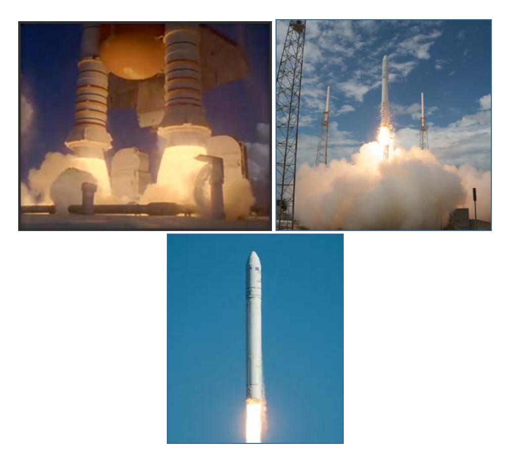
Figure 1.– Examples of launch imagery for (clockwise from top left) the Space Shuttle, SpaceX Falcon 9, and Orbital Antares.

The Human Exploration Science Office (KX) provides leadership for NASA's Imagery Integration (I^2) Team, an affiliation of experts in the use of engineering-class imagery intended to monitor the performance of launch vehicles and crewed spacecraft in flight. Typical engineering imagery assessments include studying and characterizing the liftoff and ascent debris environments; launch vehicle and propulsion element performance; in-flight activities; and entry, landing, and recovery operations. I<sup>2</sup> support has been provided not only for U.S. Government spaceflight ( e.g. , Space Shuttle, Ares I-X) but also for commercial launch providers, such as Space Exploration Technologies Corporation (SpaceX) and Orbital Sciences Corporation, servicing the International Space Station.