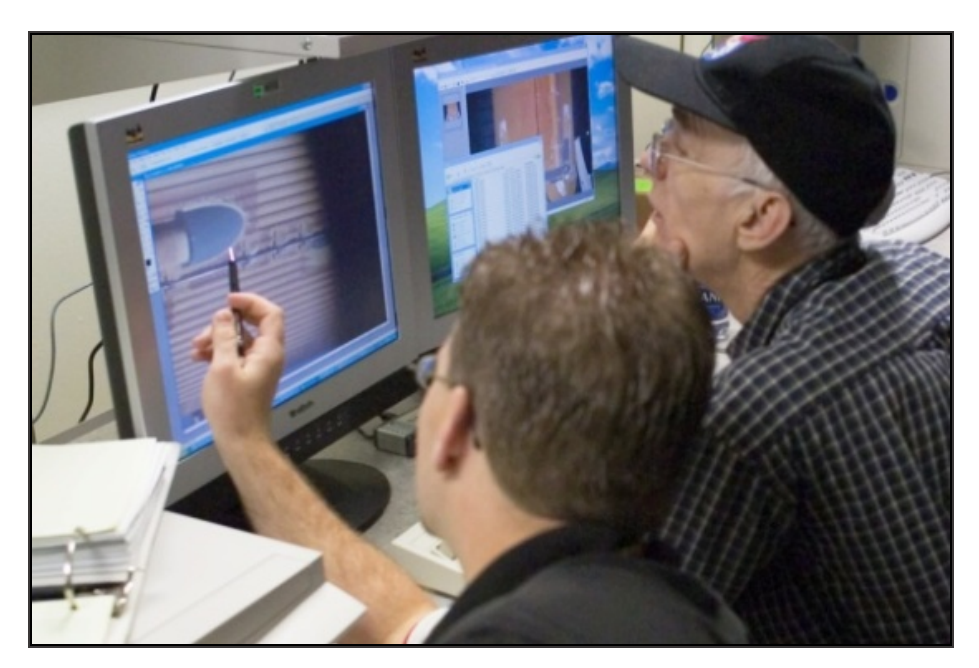
Figure 6.– Screening and analysis.

During a mission or test, the I^2 Team provides oversight of imagery operations to verify fulfillment of imagery requirements. The team oversees the collection, screening, and analysis of imagery to build a set of imagery findings. It integrates and corroborates the imagery findings with other mission data sets, generating executive summaries to support time-critical mission decisions.