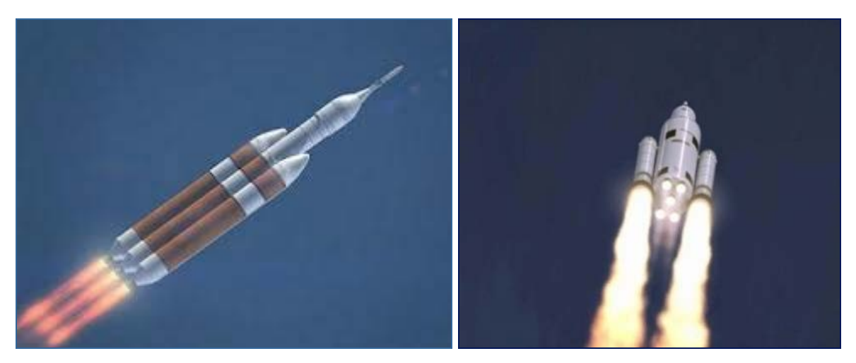
Figure 2.– (Left to right) Notional views of the EFT-1 launch vehicle and SLS.

integration services to commercial demonstration flights, Exploration Flight Test-1 (EFT-1), and the Space Launch System (SLS)–based Exploration Missions (EM)-1 and EM-2. EM-2 will be the first attempt to fly a piloted mission with the Orion spacecraft.