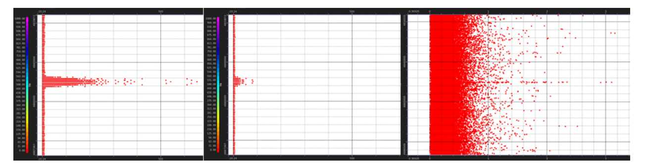
Figure 2.— Plots showing the relative amplitude of an ultrasonic signal propagating through the tile wedge, after transmission through (left to right) 0.16-in., 0.40-in., and 0.87-in. of thickness, respectively. Note that the amplitude is practically in the noise for a signal traveling through less than an inch of tile.

For through-transmission testing with the tile wedge, extremely large attenuation (1000x amplitude damping per inch of thickness) was observed in comparing ultrasonic excitation with response amplitudes (after propagation through tile material). Given these results, ISAG has no further plans to pursue such a method for spacecraft damage characterization. Results were more promising for at least one test article from Shell, and Shell may pursue such analysis further.