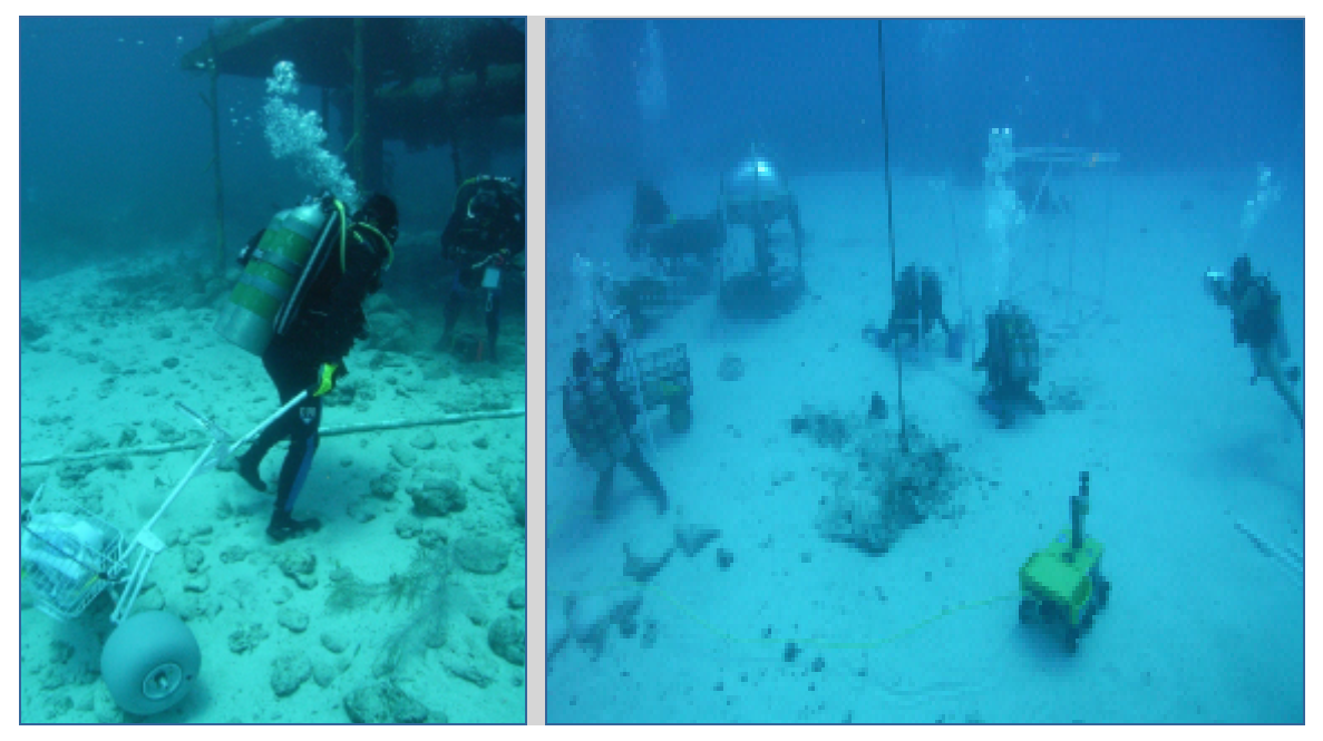
Figure 3.– A NEEMO 15 Aquanaut tests sample collection tools.