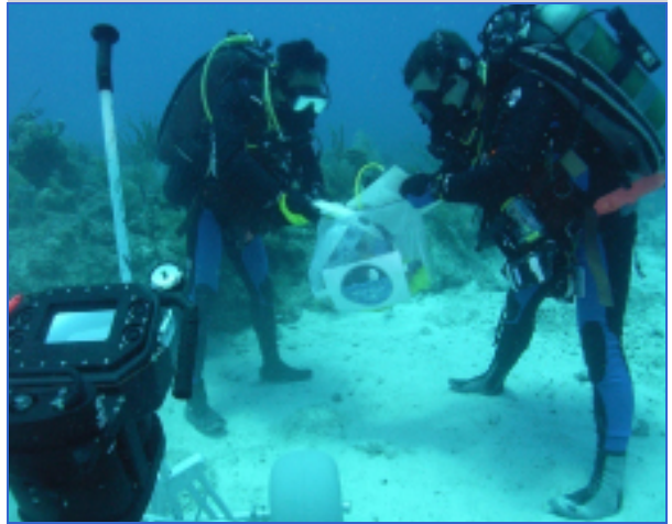
Figure 2.– NEEMO aquanauts collect and document samples.

The ARES Directorate at JSC curates all of NASA's extraterrestrial samples. ARES' mission is to protect, preserve, and distribute samples from the Moon, Mars, and interplanetary space for scientific study. These sample collections include lunar rocks and regolith returned by the Apollo missions.