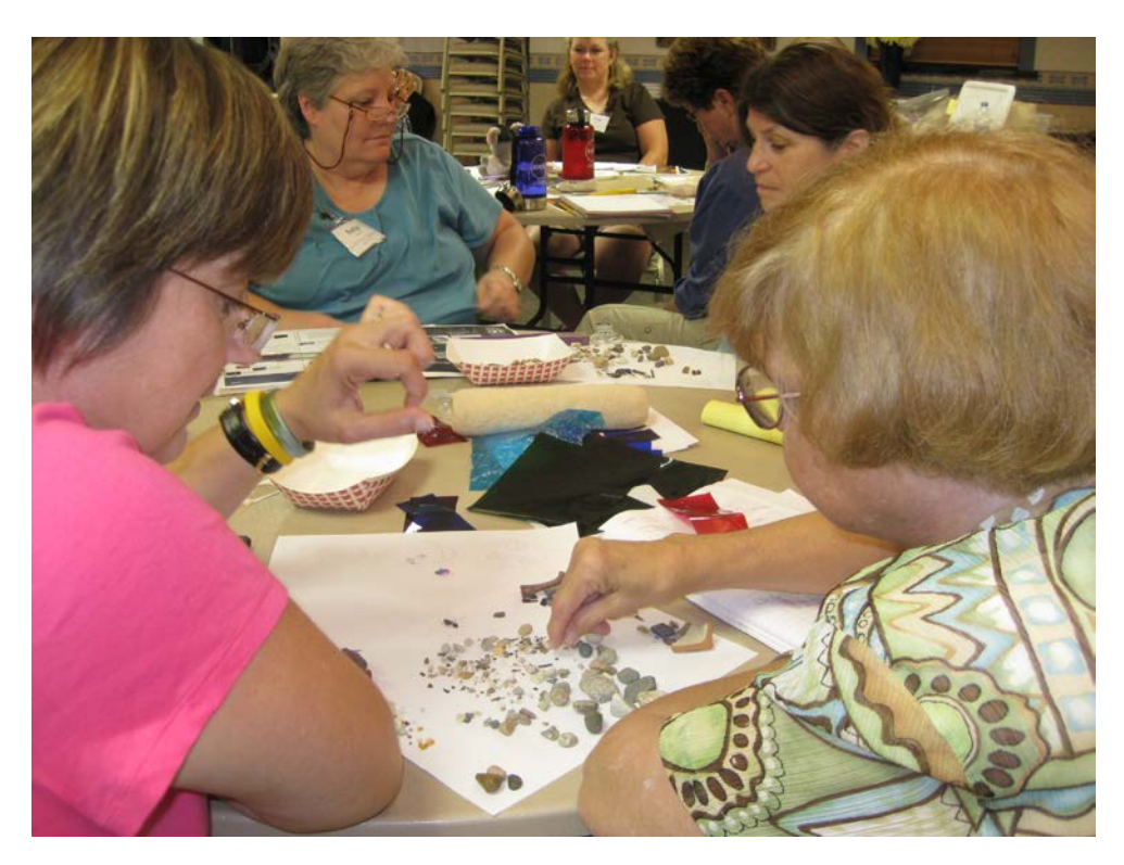
Figure 1.— Educators experience hands-on activities to share in their classrooms.

ARES continues to have a presence at state and national venues to provide science educators and after-school educators with workshops focused on ARES Directorate solar system exploration and research on topics including asteroids, the Moon, and Mars.