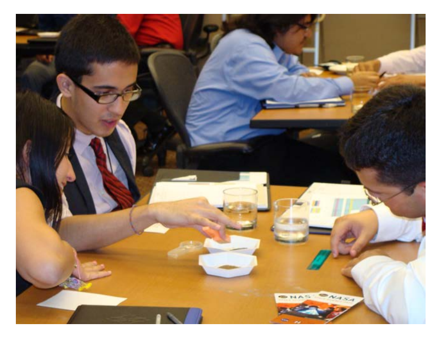
Figure 6.— SHPE student leaders at NILA describing lunar and Martian soil simulants.

intensive leadership training, and NSSD has taken advantage of the event to expose all SHPE chapters to NSSD goals. NSSD also solicits proposals from chapters interested in having NSSD host an event in their communities.