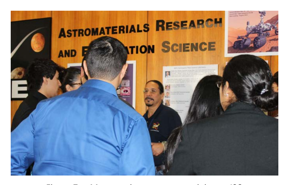
Figure 7.— Mentor science content training at JSC.

• Science content mentor training. Mentor training is held at JSC every year in December; two students from each past and future NSSD site attend a 2-day workshop conducted by ARES. Mentors attend lectures and tour laboratories to learn about ARES and prepare them to give presentations using a thematic approach to the content and related hands-on activities.