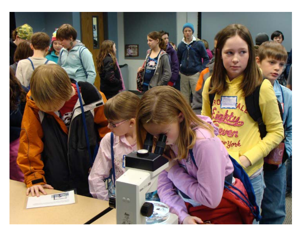
Figure 10.— Students from Cache County, Utah, eagerly wait to view lunar and meteorite educational disks through a microscope.

• National NSSD events. NSSD host sites are awarded through a proposal-review process after NILA. Currently, there are six NSSD sites nationwide, with two sites celebrating their third annual NSSD event at their university.