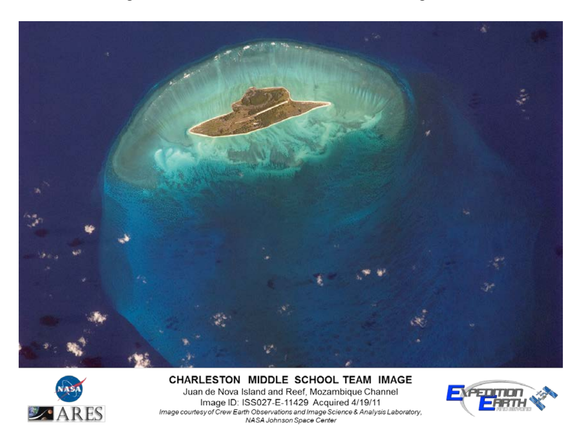
Figure 3.— CEO image acquired for a student research team.

Educator professional development workshops train hundreds of teachers to use inquiry-based, standards-aligned curricular materials designed to help students model the scientific process (figure 4). These materials enable teachers to replace previously used classroom curricula with more engaging, relevant, and inspiring activities that use the excitement of current exploration as the hook. Activities are designed to help students model the skills and practices used by Science, Technology Engineering, and Math (STEM) professionals.