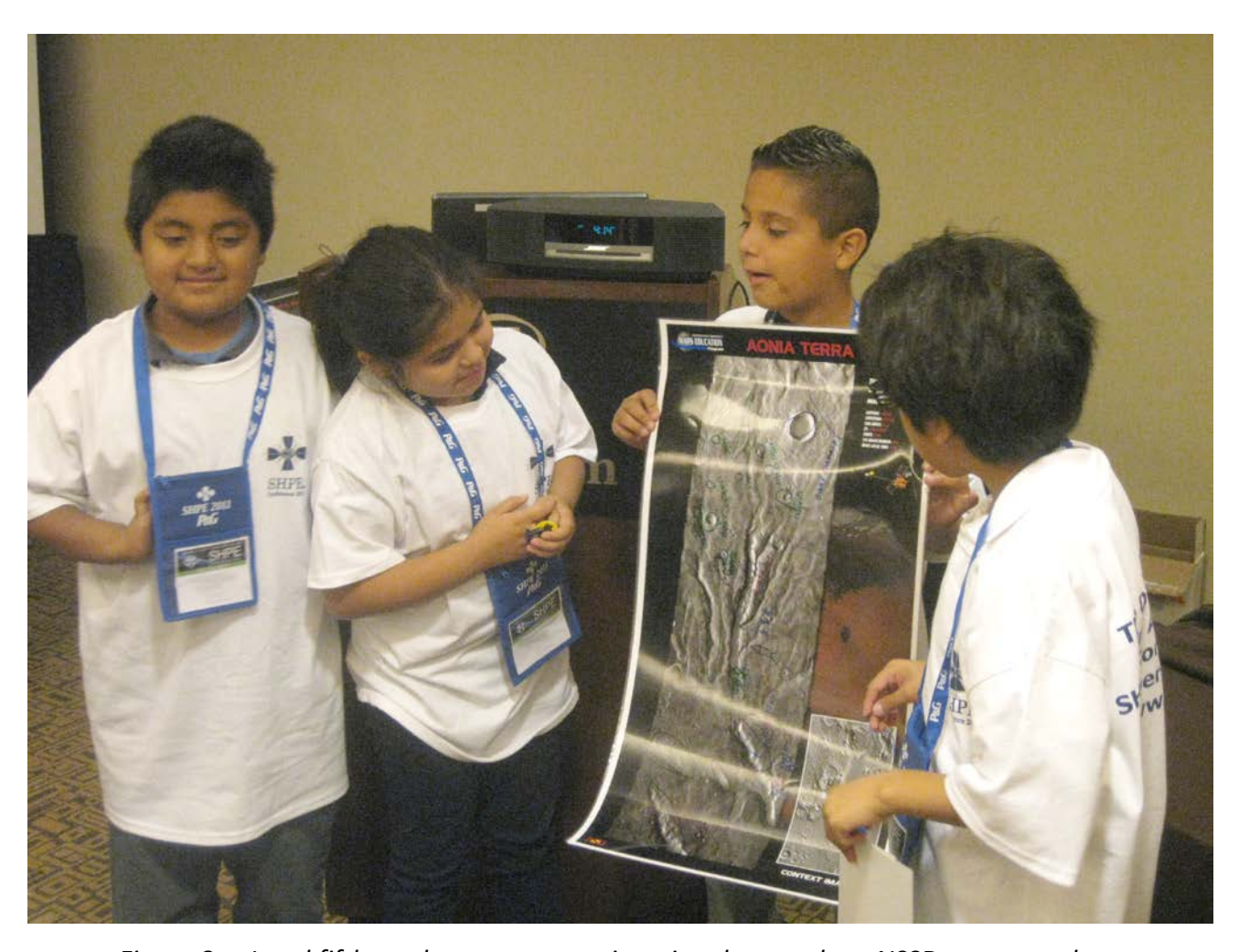
Figure 8.— Local fifth graders use remote imaging data to show NSSD mentors where they would land on Mars.

• The original NSSD event at UTB/TSC. The original NSSD event is held at the UTB/TSC campus in Brownsville, Texas, each January. The event, now in its 10<sup>th</sup> year, allows new mentors to see how the program works and actively participate in the mentoring process. About 700 fifth and eighth graders from the Texas Rio Grande Valley school districts attend the event.