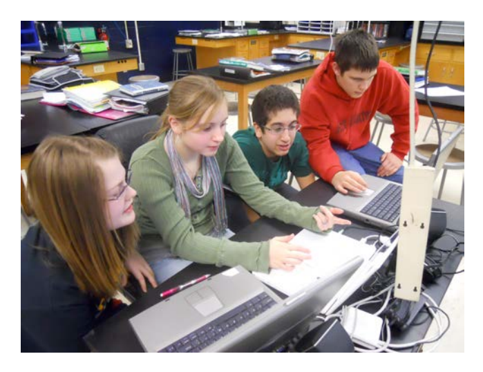
Figure 2.— Students work on a research investigation.