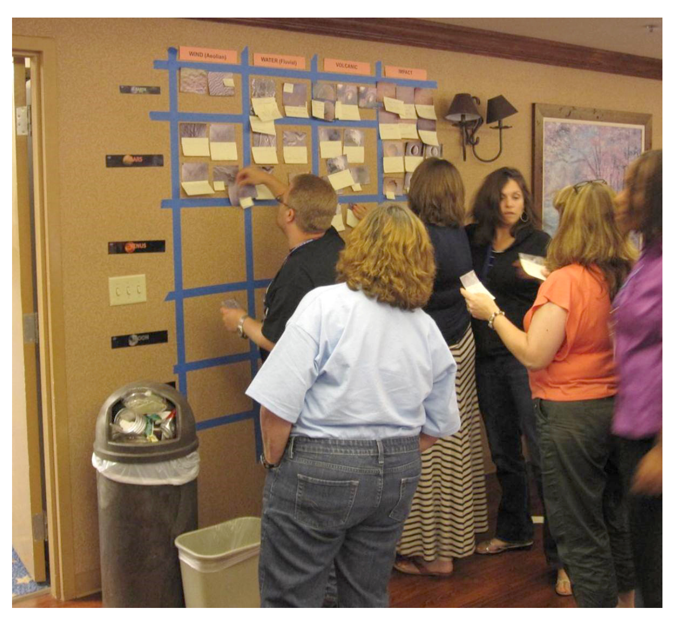
Figure 4.— Teachers build a planetary comparison feature wall at the EEAB educator workshop.

Through EEAB, classrooms across the nation can connect with ARES scientists in several ways. Classroom connection webinars enable ARES scientists to conduct interactive presentations that allow participants to increase their knowledge of Earth, planetary comparisons, and science being conducted within the ARES Directorate. Webinars have focused on such topics as using Earth to make planetary comparisons, studying volcanos on Earth and in the solar system, viewing aurora from space, and more. To highlight ARES participation in the Mars Science Laboratory (MSL) mission, numerous webinars connected ARES with thousands of students across the nation (figure 5).