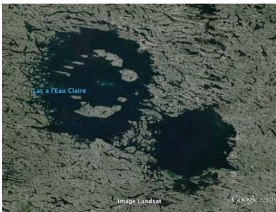
Fig. 1. Landsat image of the West (left) and East (right) Clearwater Lake impact structures.

Introduction: The West and East Clearwater Lake impact structures are two of the most distinctive and recognizable impact structures on Earth (Fig. 1). Known regionally as the “Clearwater Lake Complex”, these structures are located in northern Quebec, Canada (56°10 N, 74°20 W) ~125 km east of Hudson Bay. The currently accepted diameters are 36 km and 26 km for the West and East structures, respectively [1]. Long thought to represent a rare example of a double impact, recent age dating has called this into question with ages of ~286 Ma and ~460–470 Ma being proposed for the West and East structures, respectively [2].