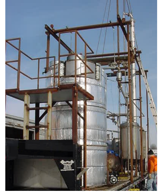
Figure 2. Commercial pilot-scale reactor for chemical recycling.