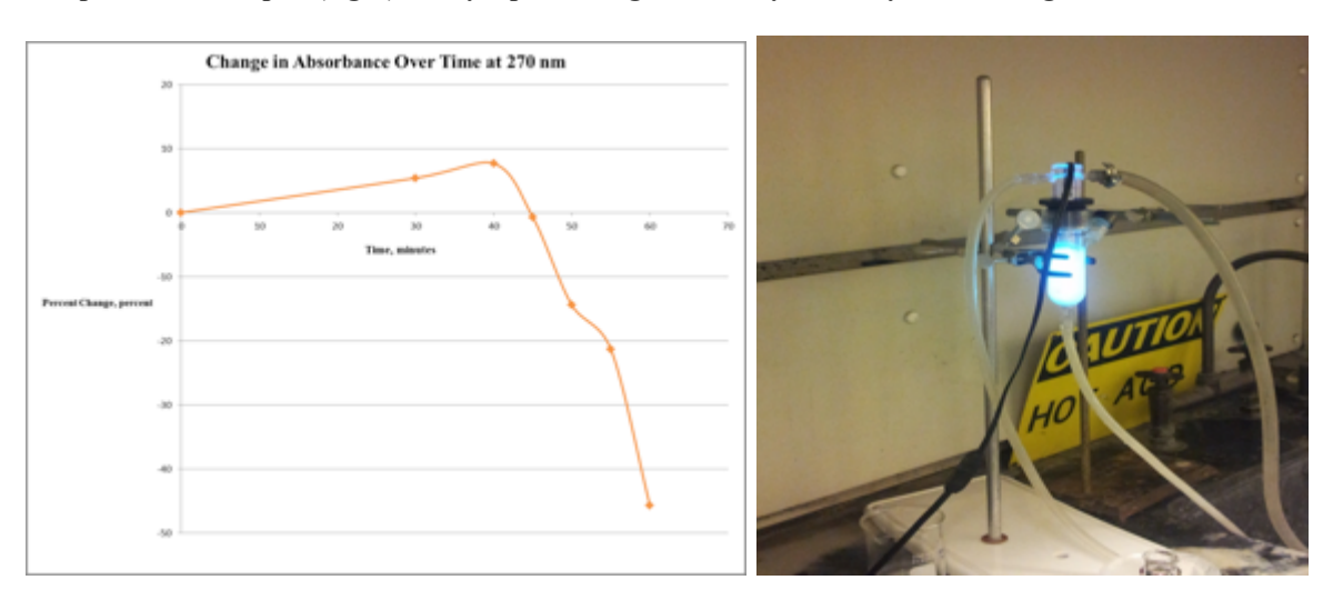
Figure 7 - Photocatalysis of phenol - (left) UV-Vis plot showing photodecomposition; (right) reactor.

Photocatalysis was also investigated as a recovery method for process water from steam reforming or CWAO. Phenol was used as model organic compound. Tests were conducted using a 15 mL photochemical reactor with a 5.5 watt mercury gaseous discharge lamp. The reactor was loaded with 6.0 x 10<sup>-4</sup> M aqueous phenol solution and 1mg of Ru-promoted titania. Phenol was completely decomposed after 60 minutes of processing as evidenced by UV/Vis absorption spectra near 270 nm (Fig. 7). Finally, concentrated solar energy is being investigated as a