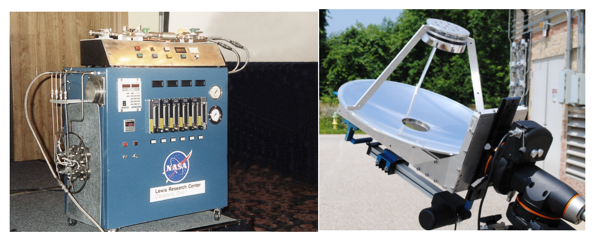
Figure 4. Two example ISRU technologies at GRC – (left) Mars CO propellant plant and (right) solar concentrator for processing regolith simulant.

"Living off the land" imposes severe constraints for utilization of power, propellants, and other expendables. The normal rigors (mass, space limitations and environmental challenges) imposed by space travel are magnified by a resource-limited situation. On the other hand, enhanced energy efficiency and minimal launch mass will simplify missions (and increase successful outcomes) by resultant limitations to planned activities. Thus the technical hurdles and challenges alluded to above will stimulate development of technology solutions for space exploration that can be spun off to solve terrestrial problems for defense, dual-use, and commercial transportation, power generation, and efficient resource utilization.<sup>22</sup> The remainder of this paper discusses new technologies and/or applications for materials processing, hardware engineering, and systems integration to enable technological solutions for the challenging technical hurdles of space exploration and green energy conversion. Fig. 4 shows examples of available NASA GRC ISRU facilities and capabilities.