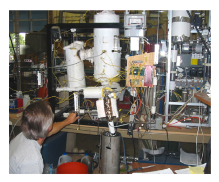
Figure 1. Steam reformer/Sabatier reactor system delivered to GRC from SBIR Phase II contract.

Alternatively, a one-step approach can be pursued, typically relying on endothermic processes that can be fueled by heat supplied by combustion of volatile low-carbon by-products (C1-C4) that are not suitable as propellants; see Fig. 2 showing an operational thermal cracking or pyrolysis unit.<sup>5</sup> These tertiary "cracking" reactions are also referred to as chemical recycling<sup>11</sup> and are much simpler from a reaction engineering and system perspective but produce relatively large amounts of solid waste or char and are not suitable for a non-terrestrial or minimally-attended environments relevant for space exploration.<sup>1-6</sup>