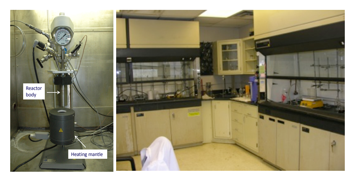
Figure 6 – (left) 100 mL stirred batch reactor, maximum temperature 500 °C, maximum pressure 5000 psi; (right) catalyst processing laboratory – facility for running CWAO reactor.