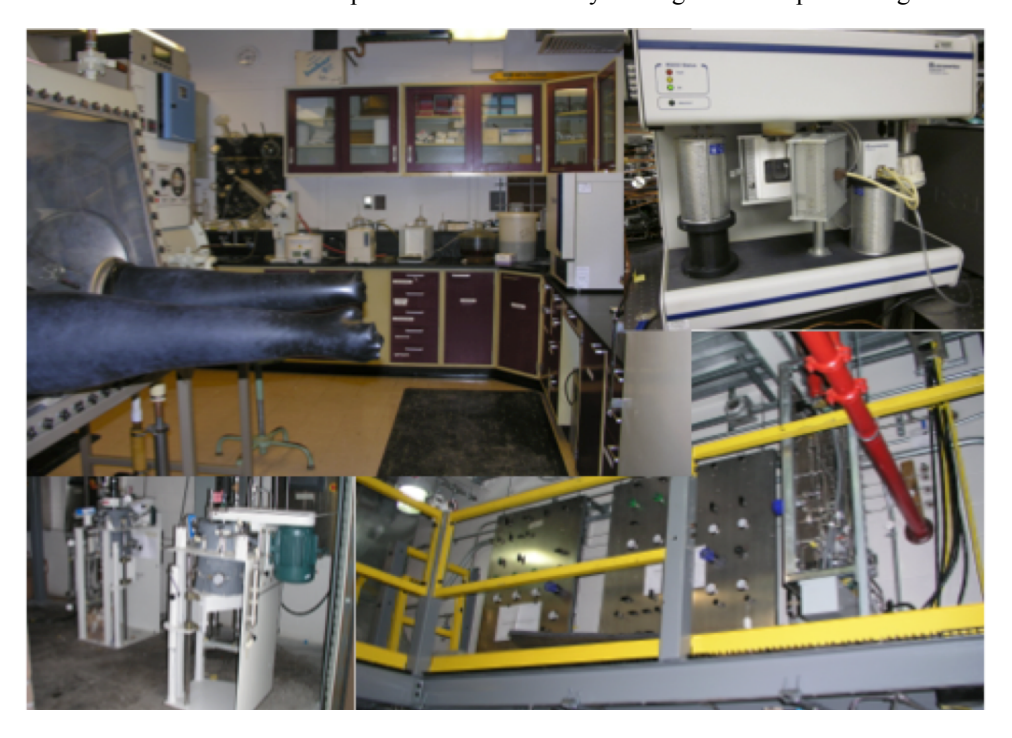
Figure 3. Example facilities for processing catalysts, characterizing, and screening fuel production catalysts; from upper left-hand corner: synthesis laboratory, instrument for TPR analysis, Alternative Fuel processing Facility, and continuously-stirred tank reactor.

In order to facilitate more rapid progress in developing optimized catalysts for aerospace propellants, an in-house effort to apply density functional theory to the interaction of small carbon and metal cluster species on oxide supports was initiated several years ago. That effort has since migrated to a local university and is now under the guidance of Prof. David Ball, in the Department of Chemistry at Cleveland State University and is described in detail below. In summary, our efforts at developing optimized catalysts for aviation fuel production has resulted in two capabilities: catalyst manufacturing and characterization and first principles calculations that can be applied to numerous problems for NASA involving challenging propellant production scenarios given scant raw materials. Fig. 3 shows several infrastructural resources in place at GRC for catalyst and green fuels processing. 5,17