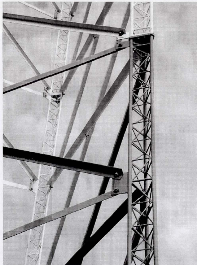
FIGURE 1. Example of a Steel Tower with a Multi-level ("Fractal") Truss Structure, Where Each of the Beams of the Truss Structure is Itself a Truss.

The improvement in performance is primarily due to lower air density. By starting at a lower atmospheric pressure, the vehicle has several design advantages that result in a reduced delta-V required to reach orbit. As well as the reduced drag, the aerodynamic advantages include: