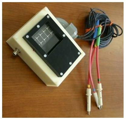
Early Prototype of EDS Lunar Experiment shown with Glass Shield and Solar Cells.