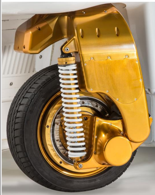
Close-up of MRV e-corner

Not having a mechanical linkage between the driver and the steering wheel introduces new risks not seen on conventional automobiles. A failed computer, or cut wire, could cause a loss of steering and the driver to lose control. Because of this, a fully redundant, fail-operational, architecture had to be developed for MRV. Should the steering motor fail, the computer system responds immediately by sending signals to a second, redundant motor. Should that computer fail, a second computer is ready to take over vehicle control. This redundancy is paramount to the safe operations of a by-wire system.