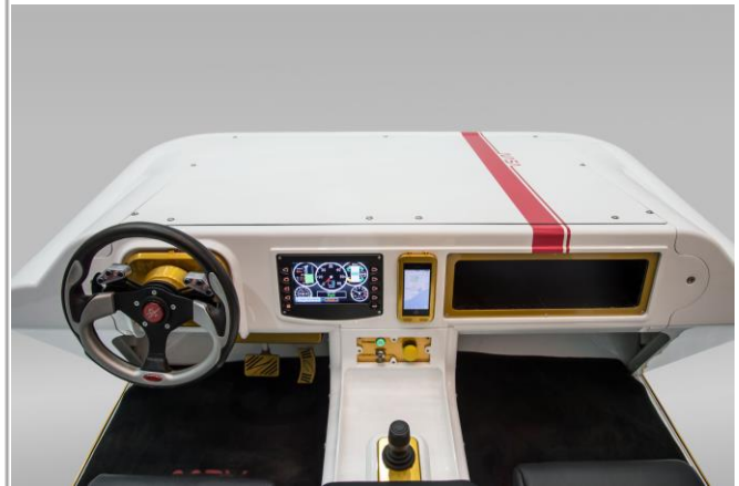
MRV Steering Wheel, Joystick, and Dashboard Controls

A configurable display allows for changing of drive modes and gives the user critical vehicle information and health and status indicators.