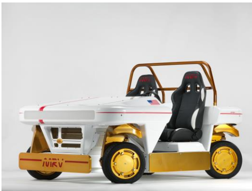
Modular Robotic Vehicle (MRV)

The Modular Robotic Vehicle, or MRV, completed in 2013, was developed at the Johnson Space Center in order to advance technologies which have applications for future vehicles both in space and on Earth. With seating for two people, MRV is a fully electric vehicle modeled as a “city car”, suited for busy urban environments.