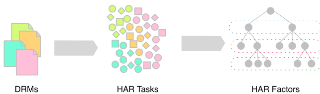
Figure 1: Assessment process overview

Based on the HAR tasks, a set of factors was derived. Figure 1 summarizes our assessment process. This “bottoms-up” approach was selected in order to ensure that the identified critical HARI factors and needs came from the future DRM requirements. Additionally, it was important to compare the needs across DRMs. In order to achieve a systematic evaluation for all DRMs, an assessment framework was outlined. A challenge to developing a consistent assessment across multiple mission architectures was that each DRM is composed of different mission elements and systems. In order to have an assessment that would be useful for comparisons across the DRMs, a set of generic system classes needed to be defined. The framework leveraged generic system classes (describe subsequently in this paper). Using this framework, the various DRMs were consistently evaluated.