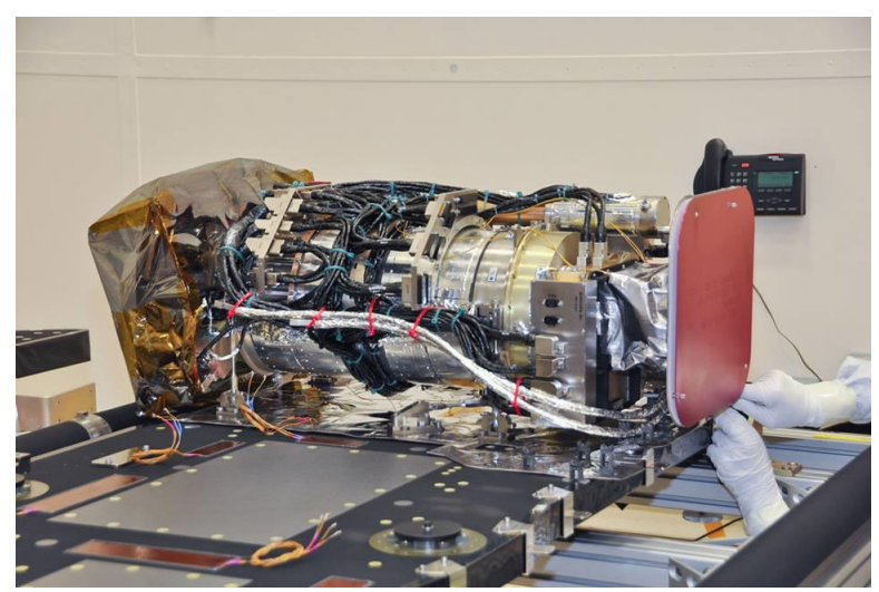
Figure 3: SUVI Telescope System on the Sun-Pointing Platform

The SEISS consists of: a Magnetospheric Particle Sensor – Low Energy (MPS-Lo) and - High Energy (MPS-Hi), a pair of Solar and Galactic Particle Sensor (SGPS) units, and an Energetic Heavy Ion Sensor (EHIS). The MPS-Lo, MPS-Hi, and EHIS units have their apertures pointed to the zenith. The two SGPS sensor units (SUs) point, one each, to the +X (the direction of the orbital velocity vector) and –X directions of the spacecraft body axes. With the exception of the +X SGPS sensor, the remaining SUs are mounted to the spacecraft-provided SEISS cabinet.