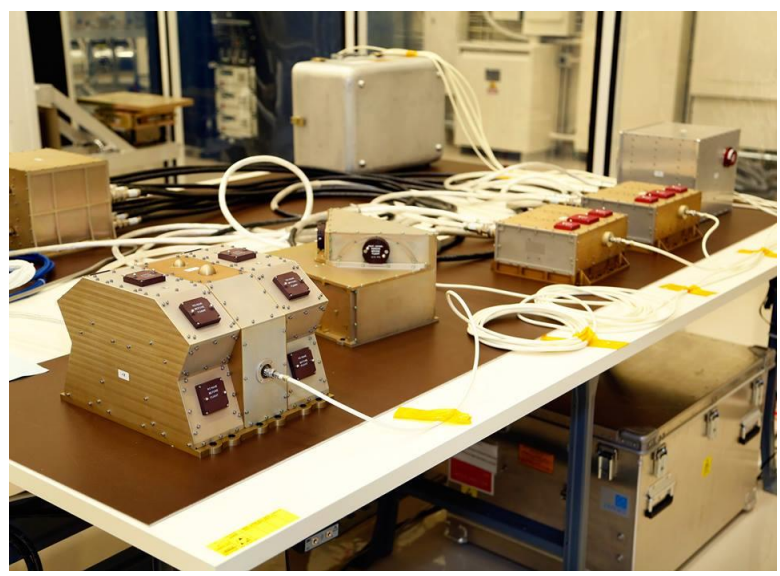
Figure 4: SEISS Instruments on the bench, from left to right: MPS-Hi, MPS-Lo, SGPS-1 & -2, and EHIS; DPU (back row, left)

Each of these instruments provides data to the Ground System (GS) via the spacecraft communication system. The GS processes the instrument data, spacecraft telemetry data, orbit determination data and other required information to autonomously generate calibrated and navigated products for the NOAA users. In the GOES-R parlance, these are called Level-1b (L1b) products.