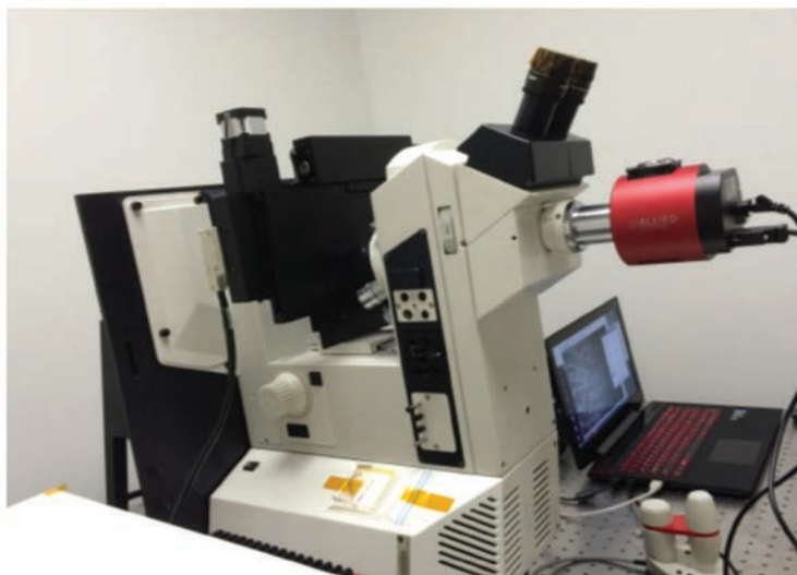
LMM emulator displayed in the vertical position.