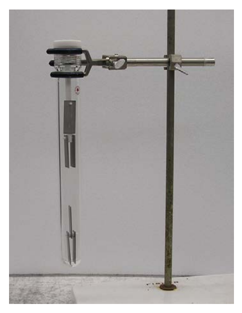
Figure 2 - Metal coupons suspended in a High Pressure Rated Glass Tube