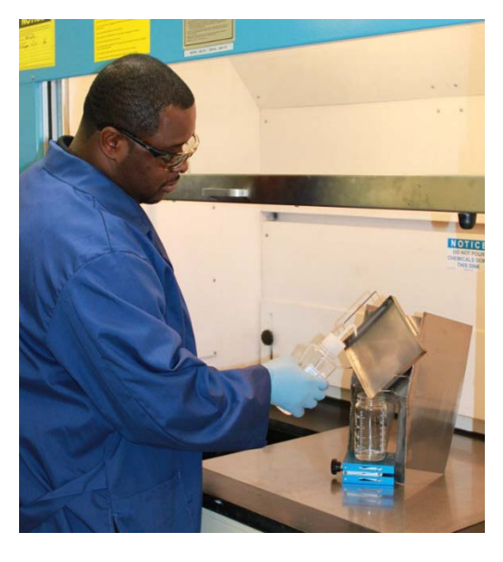
Figure 5 - Configuration to flush a test panel for the NVR removal efficiency test.

The NVR contaminants used to challenge the candidate solvents were: