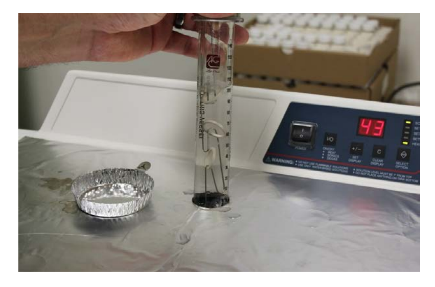
Figure 4 - O-rings suspended in solvent, ready for insertion into a heated water bath. Nine nonmetals were tested:

Three test specimens of each nonmetal, formed as O-rings or gaskets with a hole for hanging, were dried in a desiccator for 24 hours, weighed, measured for outer diameter in two directions, and immersed in boiling solvent within a high pressure borosilicate tube for 15 minutes. See figure 4. Elastomers were measured for hardness in accordance with ASTM D 2240 Standard Test Method for Rubber Property – Durometer Hardness Type A (Shore A durometer) at the point of maximum thickness prior to immersion. [15] One specimen of each material was weighed and retained as a control. The solvent was maintained at the boiling point using a constant temperature water bath. After immersion, the specimens were removed to the desiccator for 30 minutes and then weighed, measured, and inspected for evidence of deterioration. Specimens exhibiting a change in weight or linear swell of greater than 1% from the initial readings were returned to the desiccator for an additional six days and then re-measured.