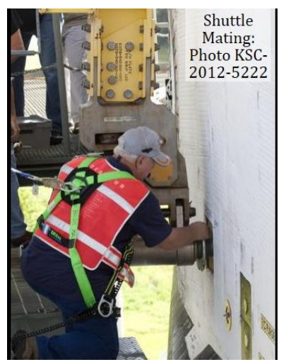
Figure 9: Mating – Physical & Visual Access

Mating and connector tasks require clear communication and other risk mitigation components. Promote standardization, clearances and correct alignments. Provide design, controls, and barriers to prevent mis-mating hardware or configurations (e.g., mechanical, electrical, fluid, fasteners, cables, software). Offer clearances for grasping, carrying, staging, and work motions, and provide checks to match intended configurations, hardware, and documentation.