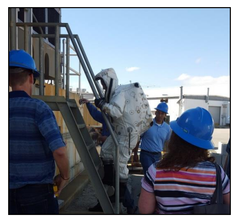
Figure 3: HF Expertise at Task Analysis Review

HF experts recommend that developers and planners refer to the checklist during task analysis activities to involve users and HF expertise in concepts of operations, procedure development, and other task design components. The team can merge subject matter proficiencies to develop improved components and processes for mitigating risks [3].