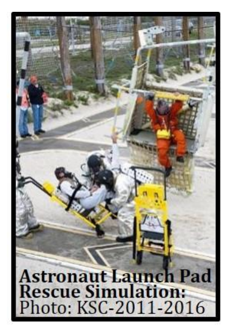
Figure 14: Astronaut Emergency Egress Simulation

Such practice can occur with acting out actual contingency or emergency tasks such as astronaut rescue at the launch pad (Fig. 14). Other practices or dry runs can start with discussions and use materials and components available.