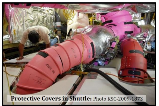
Figure 15: Protective Covers Protect Hardware and Personnel

Designing out potential risks or human error opportunities is the most effective approach. Being able to detect any damage during processing and having means for recovery are key to finalizing robust tasks and designs.