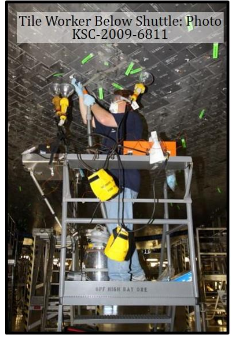
Figure 10: Work Stands with Attachments can Place Personnel/Tools/Equipment at Arm's Reach

With such expansive Space Shuttle surfaces, blends of tools and flexible shop aids brought workers to the hardware (Fig. 10), fitting the job to the person rather than creating individually designed components.