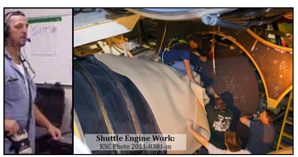
Figure 6: Communication - Key when Adjacent Work Visibility or Noises are Factors

communication devices. Prevent conflicting functions (e.g., sanding near painting; electrical near plumbing; sensitive work near vibrations, reaching across workstations). Mitigate items crossing work areas (e.g., hoses, lines).