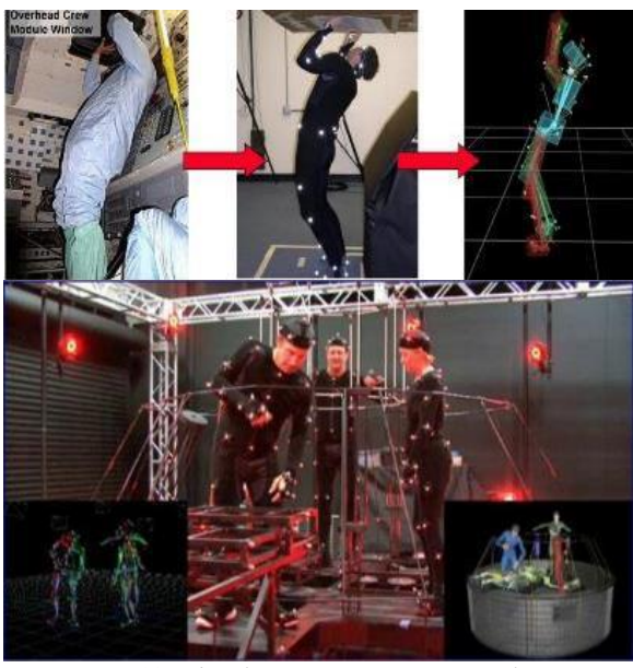
Figure 13: Shuttle Motion Capture Evaluation

Shuttle processing and operations planning for the new Orion crew module employed an example of a task design tool. HF practitioners teamed with computer science entities to develop a means to perform motion