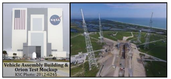
Figure 4: Launch Site Work Environment

considerations in designing or improving the humansystem integration aspects.