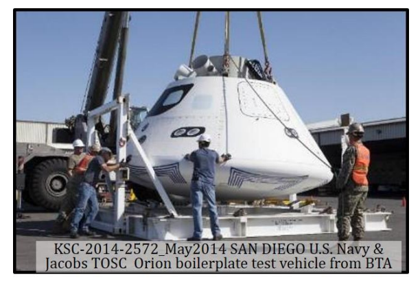
Figure 2: Practice with Orion Crew Module

Consider users and human system integration in task development and evolutions. Involve workers through concepts, work development, and changes. Reduce system interface complexities. Conduct task analysis and human-system-integration reviews. Conduct on-the job training. Practice with actual items, or use common materials or high-fidelity models, simulations, physical mock-ups. Document and incorporate lessons learned. Provide clear, correct, and complete work instructions.