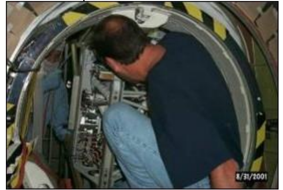
Figure 5: Limited Workspace May Warrant Mobility or Handling Aids

Provide clear and adequate physical access to perform intended work including space to operate and stage hardware and tools; interface with equipment or consoles; work adjacent to facility, hardware, or other personnel; and to work individually or in teams. These considerations are also applicable to planning for work in tight quarters to prevent, avoid, or mitigate narrow or limited workspaces.