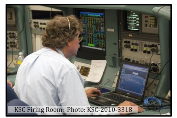
Figure 7: Control Room Operations & Communication

Besides physical tasks or designs, the HF checklist provides benefit to software, programming, and other human-computer interfaces. For example, a visual icon changing to accompany color-coded, categorized text can provide two modalities to aid the decision making process.