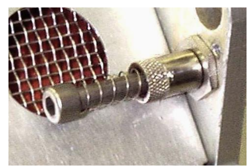
Figure 8 Captive fastener on payload hardware.

astronaut representatives and human factors experts, and helps identify potential human factors issues early in the hardware design process. The Astronaut Office also provides consultation and feedback for hardware operability differences that may be encountered in microgravity. For example, payload developers may not consider that fasteners and screws are difficult to keep track of in microgravity. An expert in microgravity operations may suggest the use of captive fasteners, like the one shown in Figure 8, to prevent fastener loss and preserve crew time. The ISS Payload Label Approval Team (IPLAT) ensures consistency in crew interface payload labeling to facilitate crew understanding of hardware. For payloads that include crew interfaces with graphic user displays, the Payload Displays Review Team (PDRT) performs usability testing and suggests ways interfaces should be improved. Taking the proper time to design hardware for usability now is an investment that can greatly reduce the risk of operator errors that may result in science loss later.