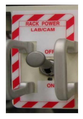
Figure 2. Rack Power Switch for MELFI Rack in the US Lab.

One final opportunity for error that will be discussed in this abbreviated list is the way humans acquire skills. As humans reach mastery of a particular skill, that behavior has a tendency to become automatic. Automatic behavior can be efficient, but results in errors when the context of the activity changes without the operator noticing. For example, a PAYCOM who is accustomed to using S/G 2 to call astronauts aboard the space station may fail to notice that S/G 2 has been privatized for a medical conference and make an erroneous call on that channel out of habit.