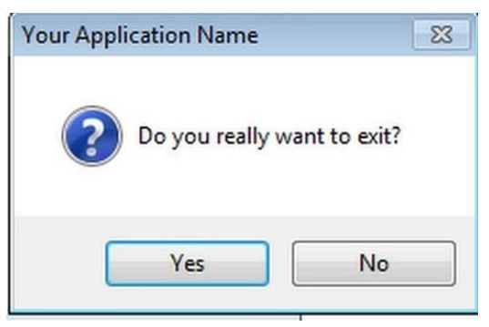
Figure 5. Verification Prompt.

who obtains permission from the ISS Flight Director. After permission is received, the commander must enable the command, select the command, and verify the command before it is sent to the vehicle. After a critical command is sent, it is automatically disabled to protect against redundant delivery. For both critical and non-critical commanding operations, verification techniques including software prompts like the one in Figure 5 have proven to be a valuable defense against errors. They provide operators the option to undo unintended actions without causing damage to systems. Multiple teams within the POIC have eliminated operator errors through the use of redundant operator verification within the chain of command and targeted implementation of human factors tools such as verification prompts in software applications.