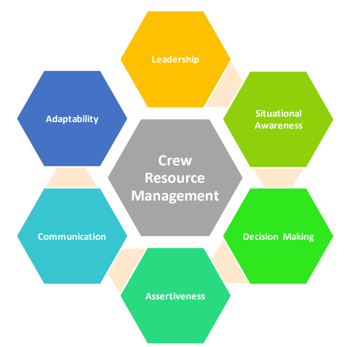
Figure 7 Foundations of Crew Resource Management.

Real time payload operations are constantly changing and often unpredictable. Standardized procedures and checklists are important tools, but cannot account for the wide variety of potential outcomes. To cope such uncertainty,