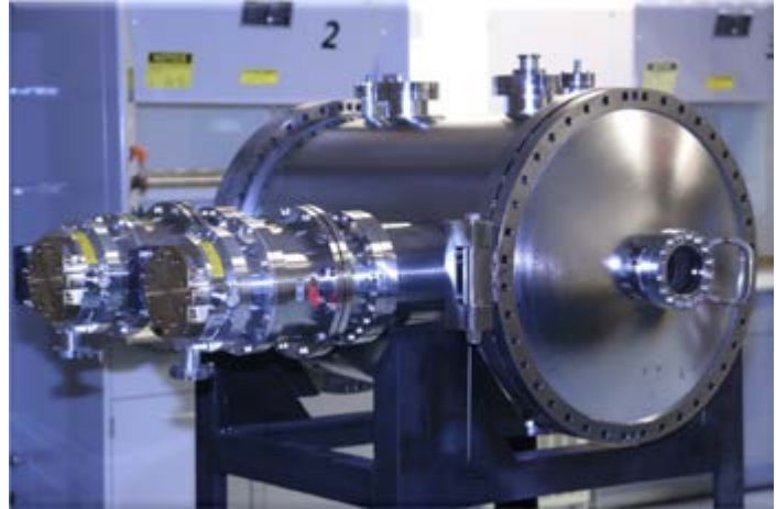
Figure 1: Propellant blocks in the MSFC Mars simulation facility.