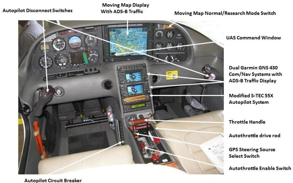
Figure 10. Cirrus UAS Surrogate Cockpit Controls

To engage the UAS Surrogate mode and control of the aircraft, a series of actions are required by both the Safety Pilot and the Systems Operator. The sequence begins with enabling power to the modified S-TEC Autopilot at a predetermined altitude above 500 feet AGL. When the aircraft is in level flight and stable at a pre-briefed altitude and speed, the Safety Pilot activates a switch that switches the autopilot steering signal source from the Garmin GNS 430 navigation unit to the