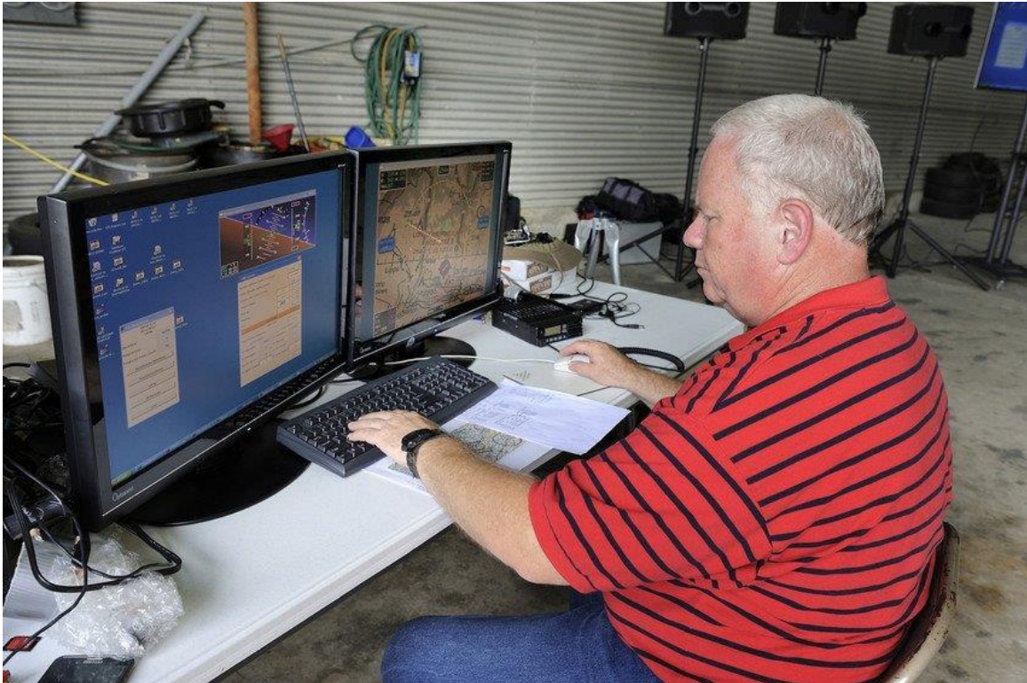
Figure 2. UAS Surrogate Ground Control Station at Lonesome Pine Airport ***

ensures that all required engineering and safety related reviews are conducted, documented, and all revealed issues are properly addressed. The ASRB also reviews the Flight Test Operations and Safety Report (FTOSR) which is also prepared by project personnel. The FTOSR spells out in detail critical aspects of the flight test such as location, time, flight conditions, weather conditions, data recording requirements, and many other flight test details 4 . The ASRB reviews these documents as well as conducting a live presentation by project personnel. The ASRB may recommend changes to the flight test based on the presented material. When the ASRB is satisfied with the flight test project and that it meets all required review and safety requirements, a Flight Safety Release (FSR) is issued. The FSR is required to conduct the flight test.