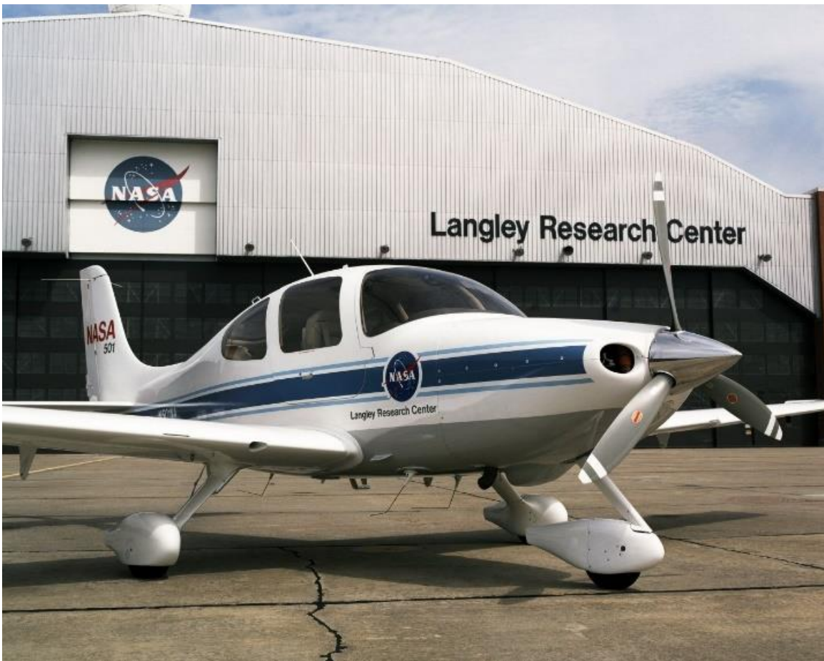
Figure 8. The NASA Langley UAS Surrogate Research Aircraft

connected to the modified S-Tech 55X Autopilot via discrete signal wires and the Aeronautical Research Incorporated (ARINC) 429 serial interface. These connections allow the computer to control the autopilot's modes, vertical speed settings, and supply steering signal inputs. The modified Avidyne EX5000 Multi-Function Display (MFD) is also connected to GPC-3 and displays the research computer generated moving map and other symbology. An instrument panel switch allows the Avidyne MFD to display normal navigation data or research video from GPC-3. Two full duplex Teledesign TS-4000 VHF radio modems (data link) are connected to GPC-3 via the RS-232 serial interface. Aircraft position, state, and status data are passed through the radios to the Ground Control Station for the generation of Moving Map and Primary Flight Displays (PFD). Command messages which include altitude, heading, vertical speed and airspeed are sent to the aircraft from the Ground Control Station to the computer via the same VHF data link radios. The GPC-3 also receives ADS-B, TIS-B, and other data from the Garmin GDL 90 UAT via both RS-422 and RS-232 serial interfaces. The human interface to the computer is via an Operator Workstation consisting of a high-resolution flat-panel display, keyboard, and 3-button mouse.