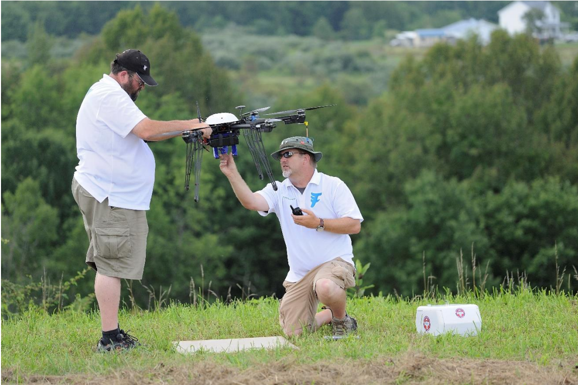
Figure 5 Flirtey personnel load medical supplies for delivery to Fairgrounds ***

The 10 pounds of medical supplies were broken into smaller packages for delivery by the Flirtey unmanned aircraft shown in Figure 4. The Flirtey team loaded the medical supplies in a container designed to attach to the underside of the Flirtey UAS and to be lowered to the recipients while the aircraft hovers a safe distance above the delivery point. The Flirtey team is shown preparing the aircraft for flight in Figure 5. The first Flirtey delivery aircraft departed the Lonesome Pine Airport at 10:50 a.m. for the 0.8-mile flight to the Wise County Fairgrounds. The first Flirtey medicine delivery at the Fairgrounds occurred at 11:00 a.m. The first delivery of medical supplies at the Wise County Fairgrounds is shown in Figure 6. Figure 7 shows one of the multiple Flirtey medical supply deliveries being received by the Virginia Governor and other officials at the RAM annual free clinic at the Wise County Fairgrounds.