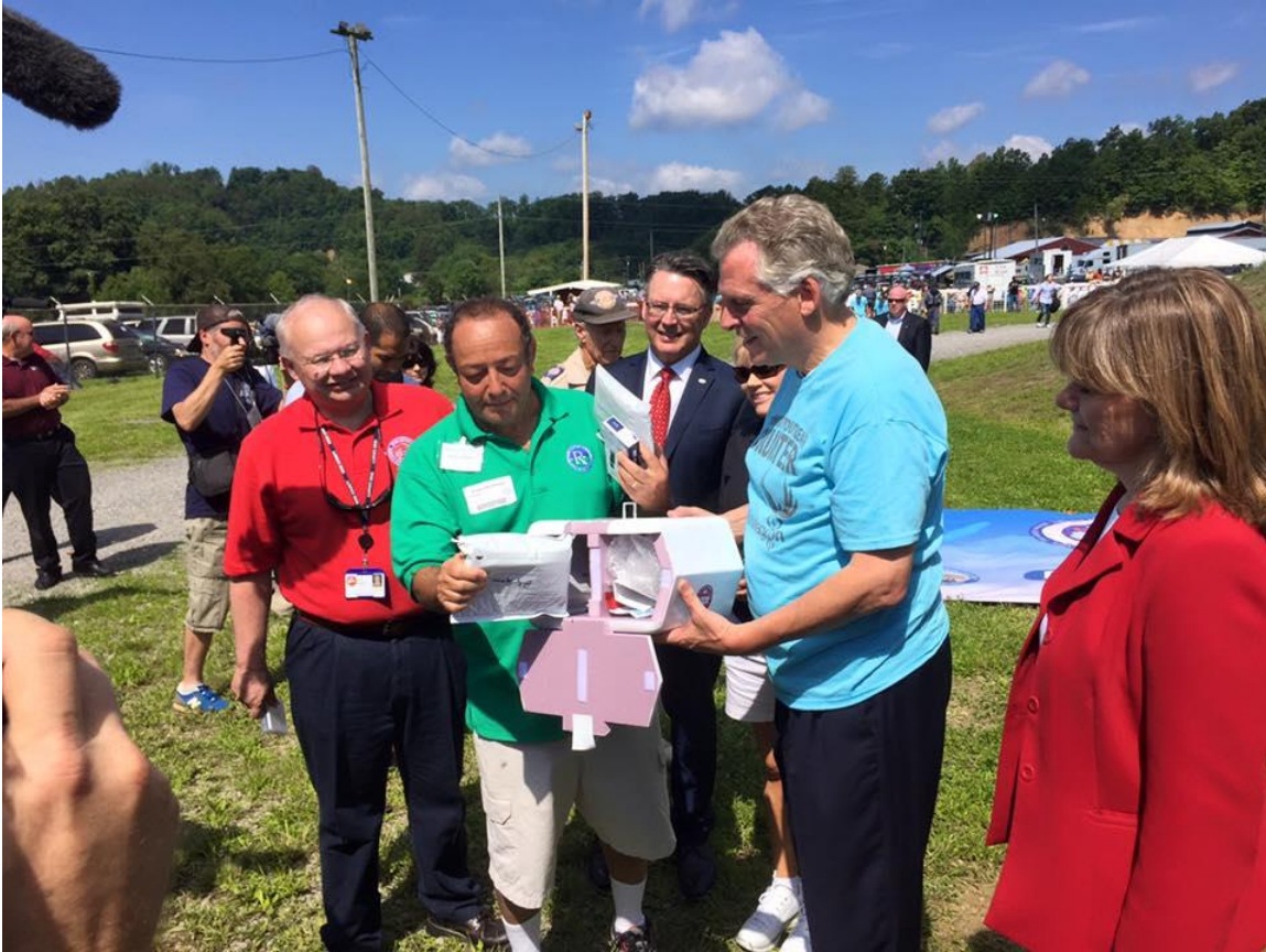
Figure 7. Virginia Governor McAuliffe receives medical supplies delivered by Flirtey UAS****