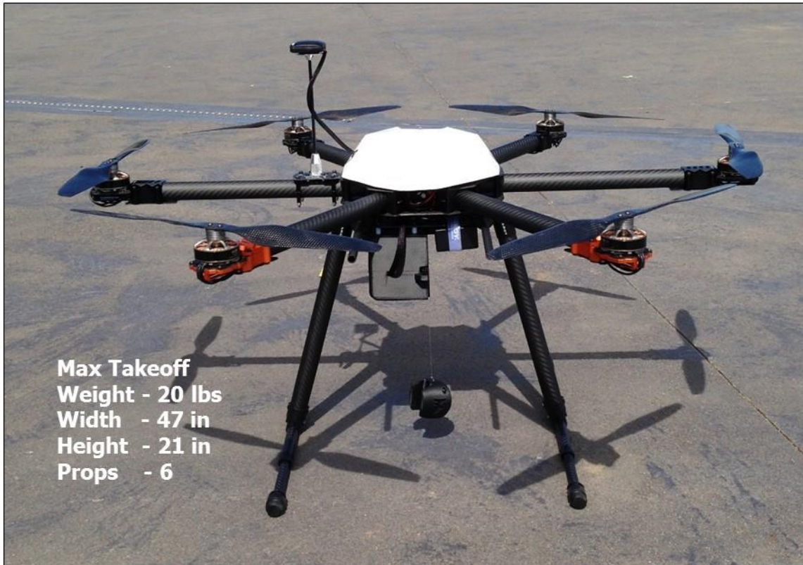
Figure 4. Flirtey F2.4 Hexcopter UAS package delivery aircraft

The UAS Surrogate aircraft departed Tazewell at 9:26 a.m. with the Safety Pilot controlling the aircraft. Once stable and above 500 feet altitude, aircraft control was passed to the UAS Ground Control Station Operator at Lonesome Pine for the return flight. The pre-planned return flight under UAS Ground Control Station Operator control was used to demonstrate UAS Surrogate flight operations to observers at Lonesome Pine. Observers watched the flight progress on the two 60-inch flat panel displays with the moving map on one display and the aircraft attitude display on the other. Also shown on the displays were command and status information transmitted from the aircraft. As the aircraft got closer to Lonesome Pine, a decision was made to postpone the landing due to the anticipated arrival of the Governor of Virginia at the Lonesome Pine Airport. The postponed landing was also used to demonstrate the remote control of the aircraft. Under UAS Ground Control Station control, the aircraft circled the airport at an altitude of about 1000 feet. Ground observers were able to see the aircraft circle overhead, observe the Ground Control Station commands, see the aircraft respond on the displays, and hear the voice communications between the aircraft and ground.