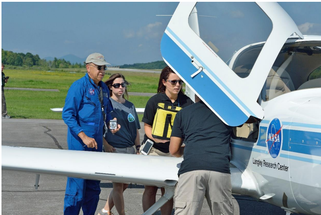
Figure 3 The NASA Langley UAS Surrogate delivers medical supplies to Lonesome Pine †††

In order to prepare for the “Let’s Fly Wisely” event, a group from NASA Langley traveled to Wise in order to conduct a site survey. The site survey was intended to answer many questions about operating in Wise. Questions concerning aircraft hangar facilities, fuel availability, maintenance support, ground support equipment and other aircraft related questions were answered during the trip that occurred on May 30, 2015. Other questions related to the UAS Surrogate Ground Control Station were also answered. These questions included where to install communications antennas, radios, computers, and displays. Other questions concerned the possibility of radio interference and the operating range of the radio data link systems. Radio equipment was used to scan for interference on the authorized voice communications and data link frequencies and no interference was found. As a result of the site survey, the team determined what equipment was needed for the later deployment to Wise.