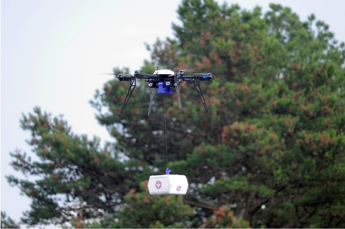
Figure 6. Flirtey UAS delivers medical supplies to the Wise County Fairgrounds §§§