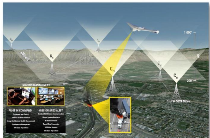
Figure 2 - PBLOS Single C-Band Channels

Point-to-Point Command and Control: For the purpose of this study, we assume use of the existing (9) DTRS locations currently installed in Mesa County, CO for siting the C2 C-Band radios (Figure 2). These existing sites are strategically located throughout Mesa County to provide APCO-25 (P25) Common Air Interface Exclusive UHF (700/800 MHz) Voice/Digital Communications to authorized First Responders providing emergency services throughout the Mesa County area. The study assumed a conservative capacity of 200 UAS which is in excess of the needs of Mesa County. Through significant technical analysis, it was concluded that a relatively simple and inexpensive PTP network will provide sufficient capacity for Mesa County and that a transition to a more complex and more expensive Network approach is not needed for the foreseeable future (through 2035).