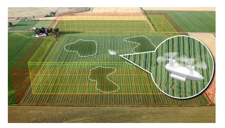
Figure 1. Concept for Precision Agricultural Application with Unmanned Rotorcraft

The ConOps for the NASA study<sup>10</sup> focused on a midsize rotary wing UAS intended to spot treat crops in a precision agriculture operation, as shown in Figure 1.