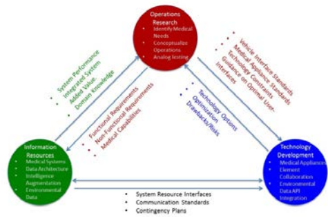
Figure 1. Relationships between research divisions in the Exploration Medical Capability Element.