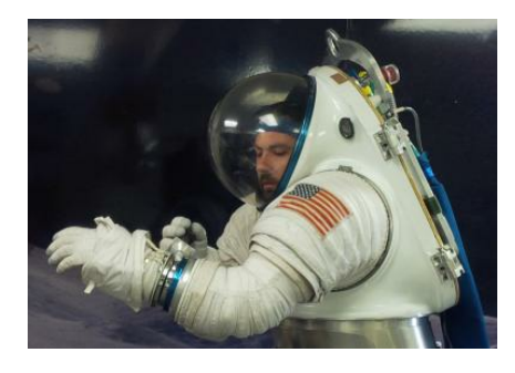
Form, Fit, and Function Testing of EVA Swab With Mark III Suited Subject

NASA has a strategic knowledge gap (B5-3) regarding what life signatures leak/vent from our Extravehicular Activity (EVA) systems; this potentially impacts how we will search for evidence of life at exploration destinations. Funding will be used to fabricate and sterilize test consumables (swab tips), prepare Test Readiness Review products (such as materials compatibility and hazard assessments), certify the EVA Swab Tool, participate in test opportunities as they arise, and perform analysis on collected swabs.