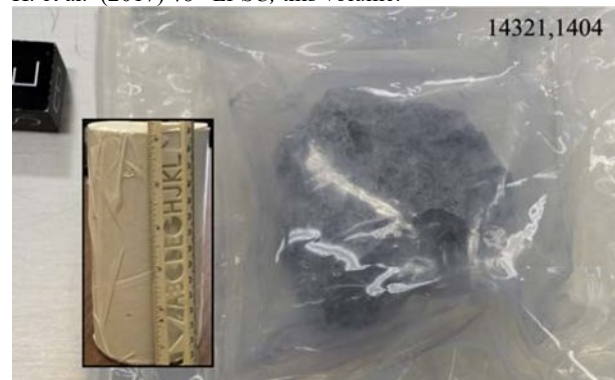
Figure 2: Sample 14321,1404 triply sealed in a Teflon bags, then immobilized inside of a cardboard tube for analysis. This allowed a non-contaminating N 2 gas atmosphere to be maintained at all

References: [1] Allen, C. et al., (2011). Chemie Der Erde-Geochemistry , 71, 1-20. [2] McCubbin, F. M. et al. (2016) 47 th LPSC , abstract #2668. [3] Kuebler, K. E. et al. (1999) Icarus 141, 96-106. [4] McCoy et al (2002) EPSL 246, 102-108. [5] Zolensky M. et al. (2014) MAPS 49, 1997-2016. [6] Almeida N. V. et al. (2014), MAPS 77 abstract #5033. [7] Smith C. L. (2013) MAPS 76, abstract #5323. [8] Zeigler R.A. (2014) 45 th LPSC , abstract #2665. [9] Sears, D. et al. (2016) MAPS 51.4, 833-838. [10] Welzenbach, L. C. et al. (2017) 48 th LPSC , this volume. [11] Blumenfeld. E. H. et al. (2017) 48 th LPSC , this volume.