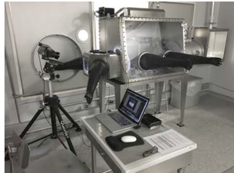
Figure 1: HRPP equipment setup in Lunar Laboratory, Johnson Space Center.

advance of the creation of the final models, we are assured that we will be offering scientists an unprecedented research tool for preliminary investigation and targeted sub-sample requests. Additionally, this project yields 3D models that are a visually engaging and interactive tool for bringing astromaterials science to the public. All 3D VAS models and original data will be served on NASA's Astromaterials Acquisition and Curation website ( https://curator.jsc.nasa.gov ) and is set to launch in 2019.