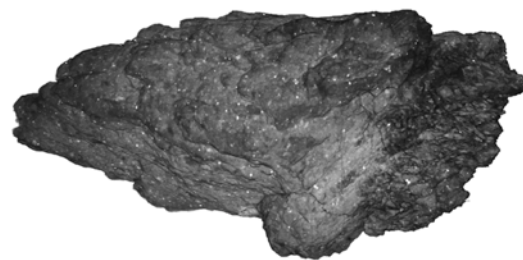
Figure 4: XCT-derived 3D model of Apollo Lunar Sample 79115,0

References: [1] Blumenfeld E. H. et al. (2014) Metsoc 77 , Abstract #5391. [2] Blumenfeld E. H. et al. (2015) 46 th LPSC, Abstract #2740. [3] Blumenfeld E. H. et al. (2016) AGU Fall Meeting , Abstract #190585. [4] Allen C. et al. (2011) Chemie der Erde , 71, 1-20. [5] Ketcham R. A. et al. (2001) Computers and Geosciences , 27, 381-400. [6] Beaulieu K. R. et al. 48 th LPSC.